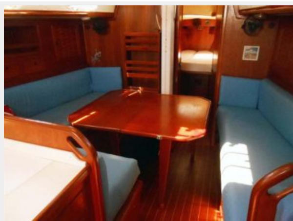
Salon with Table Leaf Up