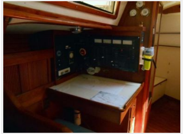
Chart Table and Navigation Station