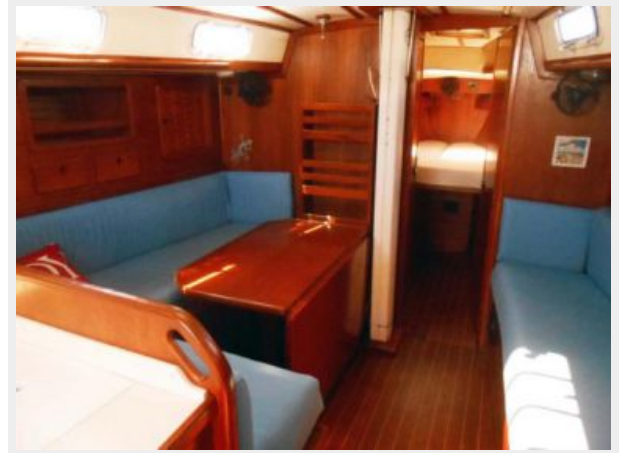
Salon with Table Leaf Down