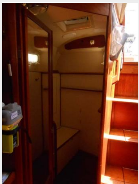
Head and Shower