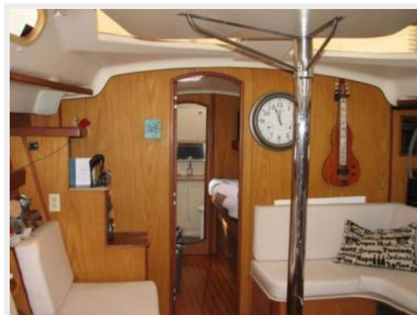
Salon View From Aft