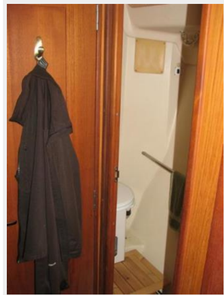
Owner's Separate Head