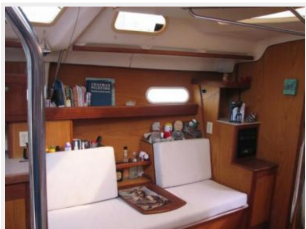
Salon Settee Lounge