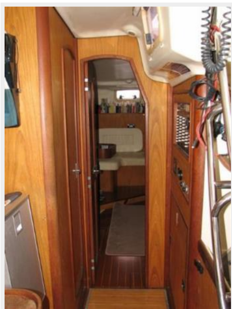
Owner's Cabin Entryway