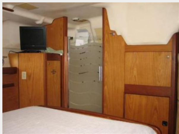
Owner's Tub/Shower Door Closed