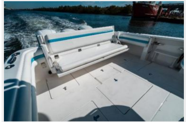
Cockpit Seating Down