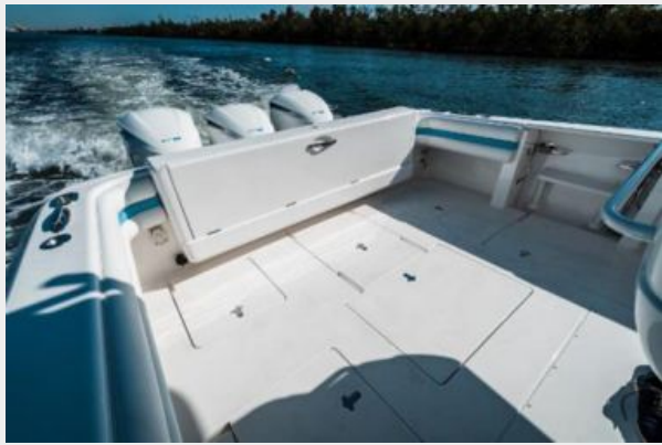
Cockpit Seating Up