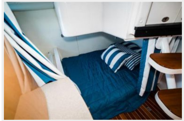
Full Berth Aft