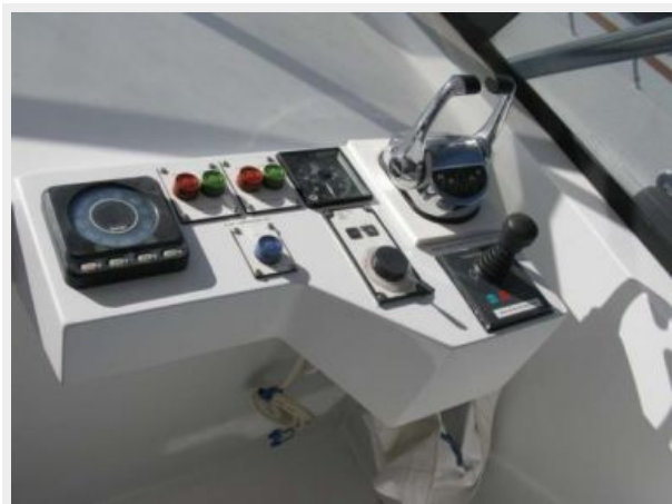
Flybridge Console to Starboard