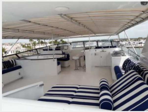
Flybridge to Aft