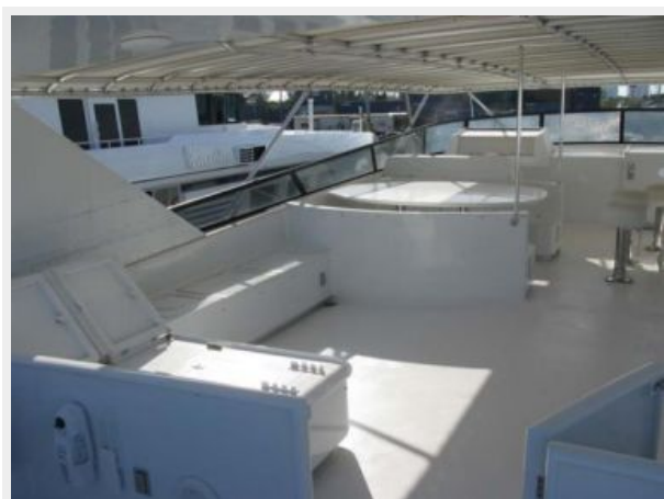
Flybridge to Port