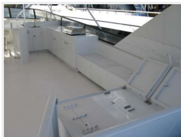
Flybridge to Starboard