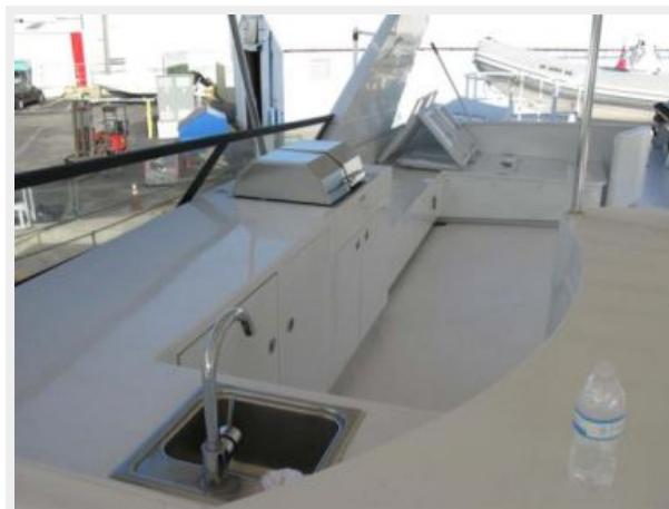
Flybridge to Aft