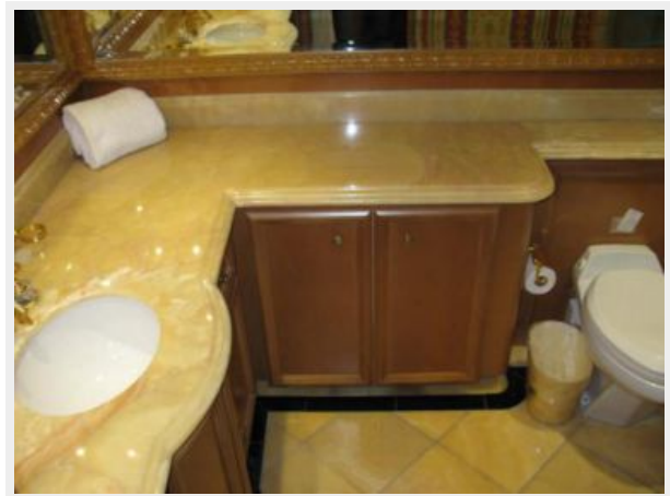
Master Stateroom Bath