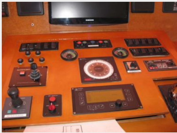
Main Helm Console