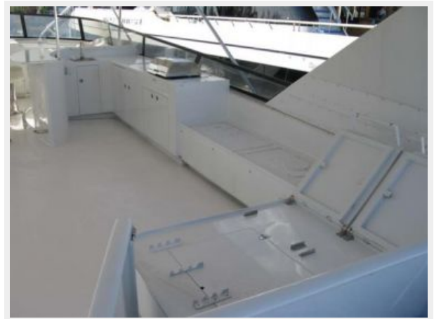
Flybridge to Starboard