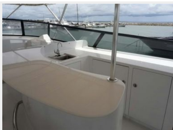
Flybridge Wet Bar