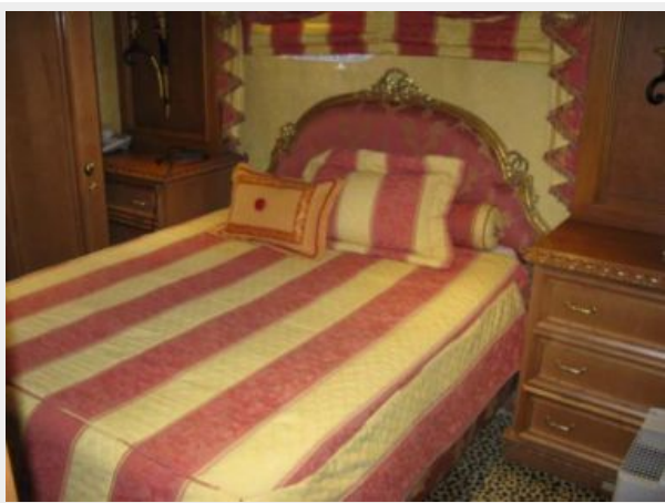
2nd Guest Stateroom