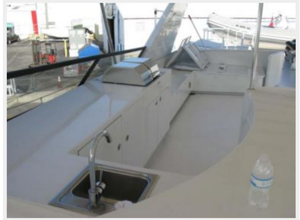
Flybridge to Aft