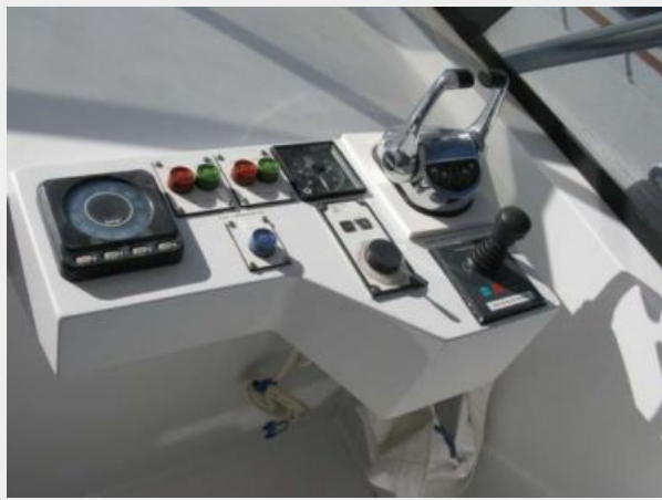
Flybridge Console to Starboard