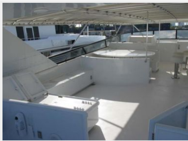
Flybridge to Port