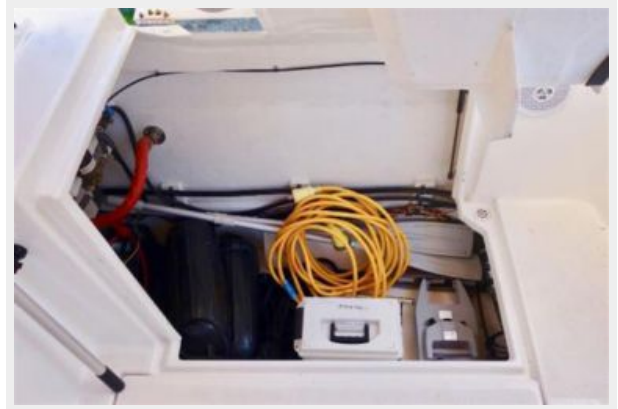
Tender Davit system