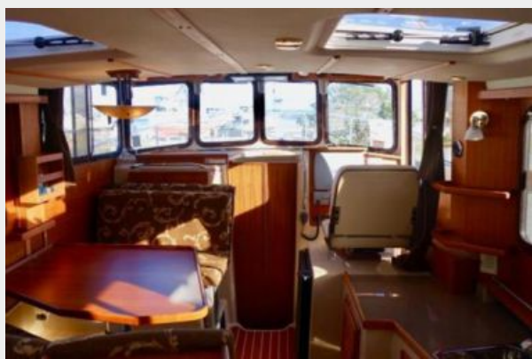
Salon - Looking Forward