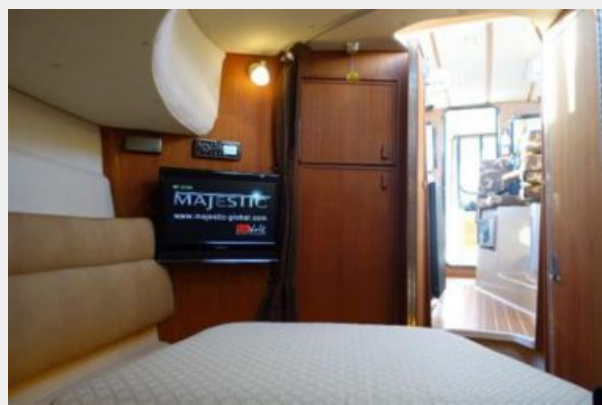
Forward Cabin 2