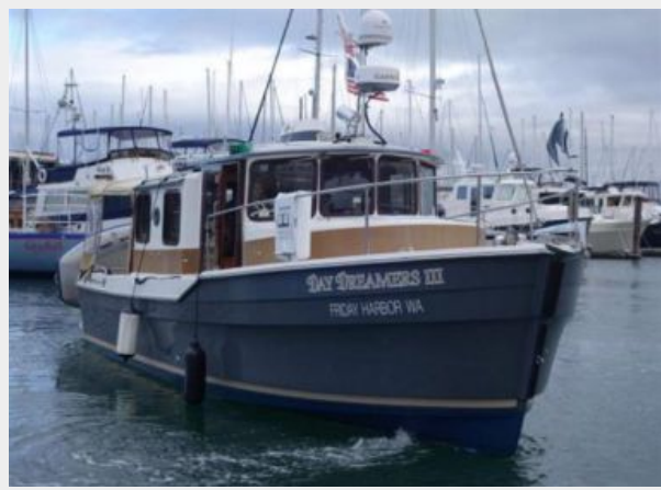
Starboard Qtr View