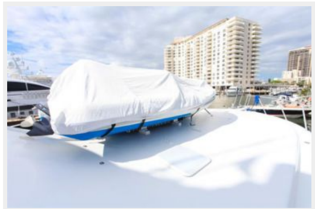
65 Viking Convertible Tender