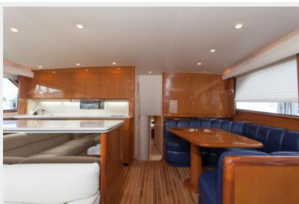
65 Viking Convertible Galley-Dinette