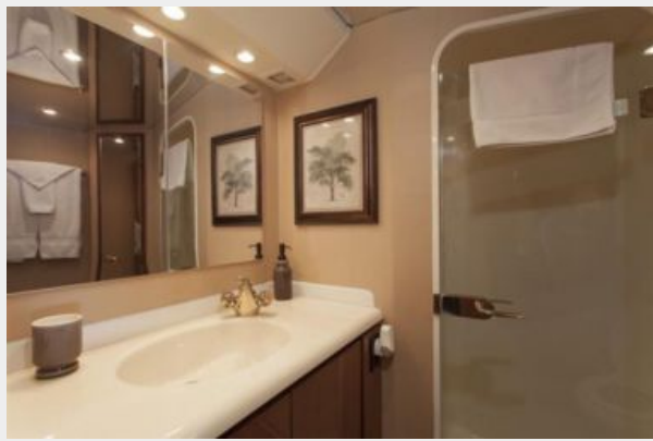
65 Viking Convertible Master Head