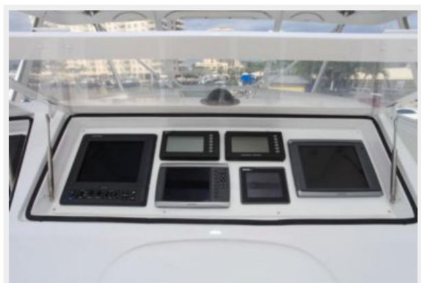
65 Viking Convertible Helm Electronics