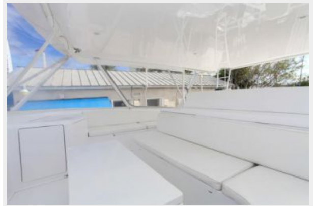
65 Viking Convertible Flybridge Seating