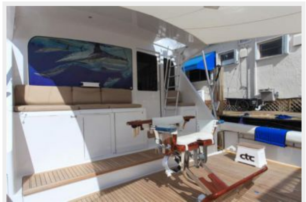
65 Viking Convertible Cockpit Fight Chair