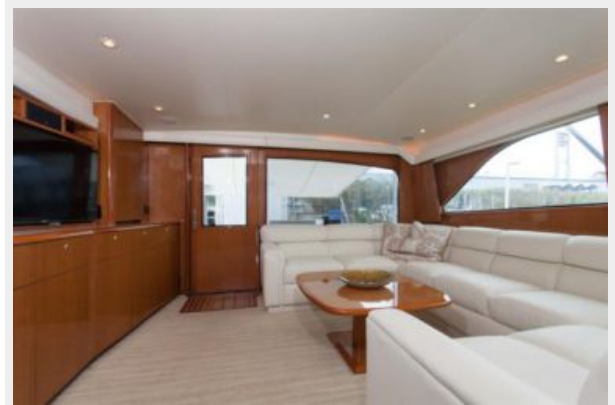
65 Viking Convertible Salon