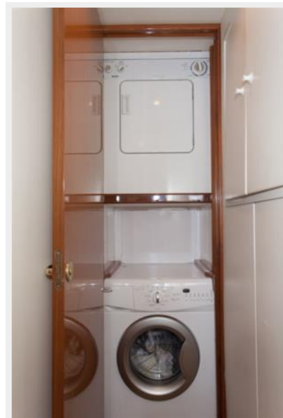
65 Viking Convertible Washer Dryer