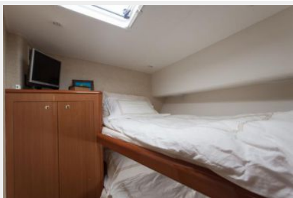
65 Viking Convertible Stbd Stateroom