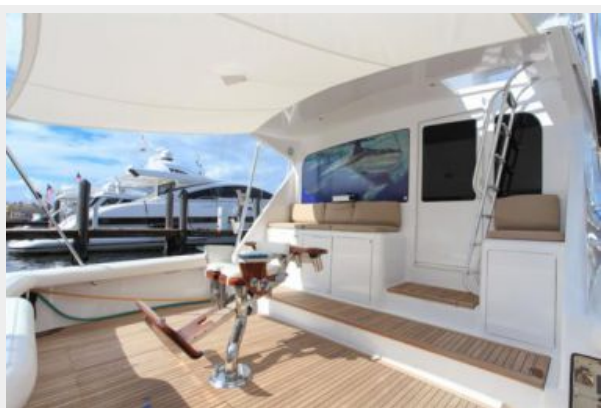
65 Viking Convertible Cockpit