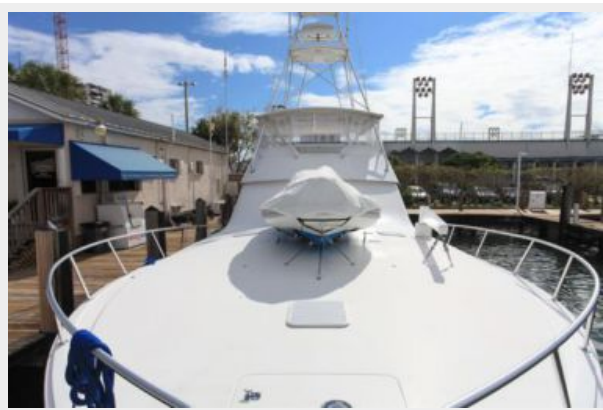
65 Viking Convertible Bow Tender