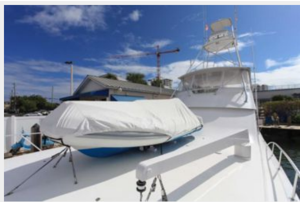
65 Viking Convertible Davit