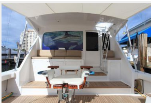
65 Viking Convertible Cockpit