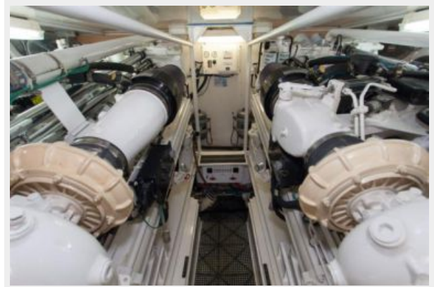
65 Viking Convertible Engine Room