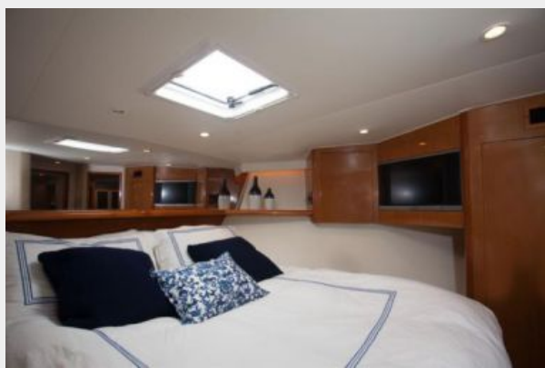
65 Viking Convertible VIP Stateroom