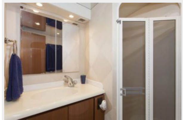
65 Viking Convertible VIP Head