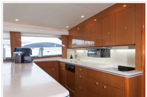
65 Viking Convertible Galley