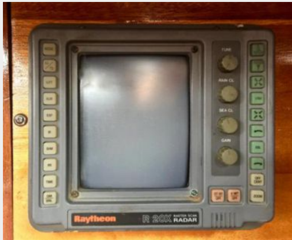
Raytheon Radar Display