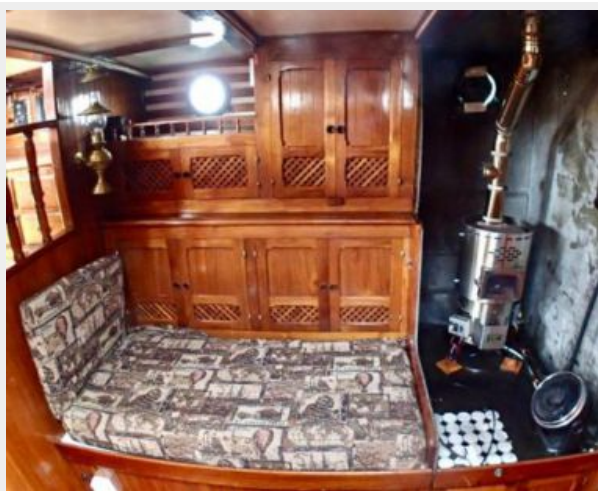
Portside Media Room