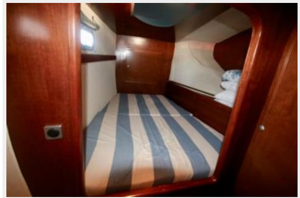
Forward guest cabin