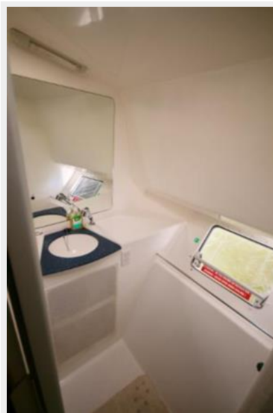
Guest head and shower