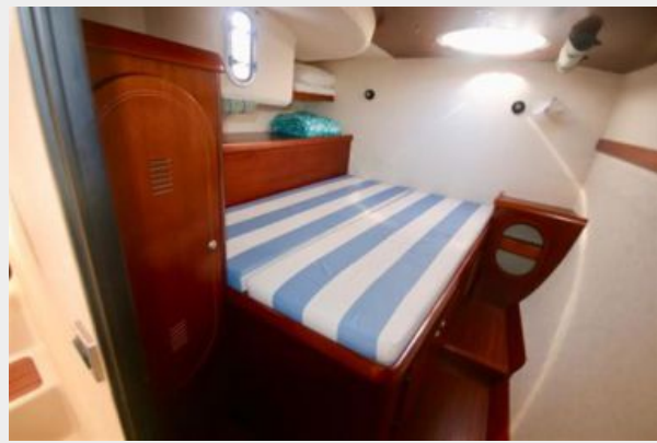
Aft guest cabin