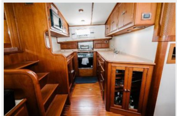
Galley to Port