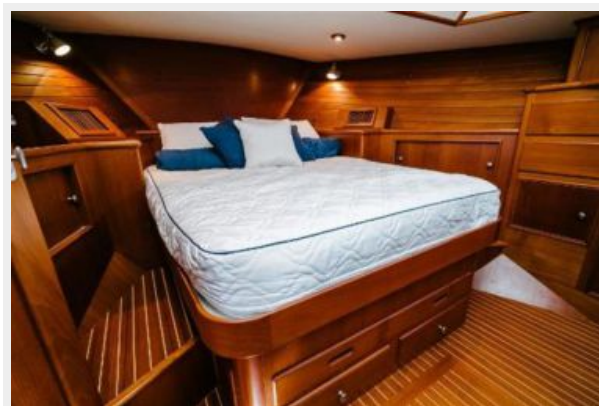
Master Stateroom 2