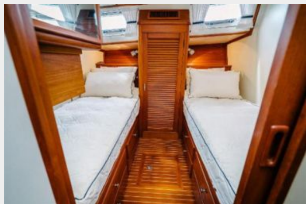
Guest Stateroom to Port