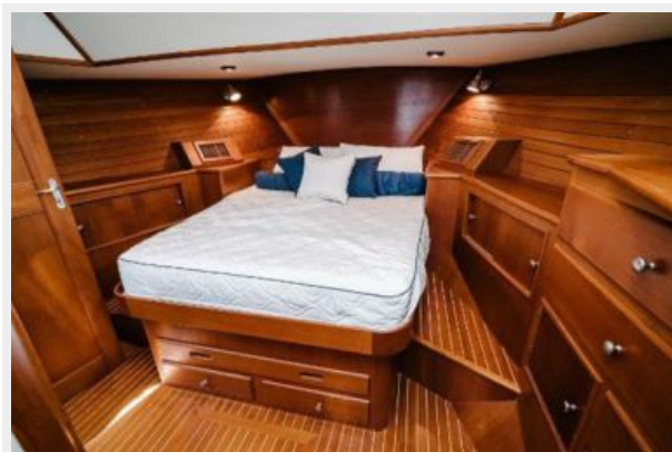
Master Stateroom 1