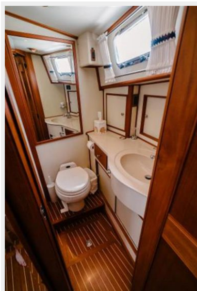
Master Head 1