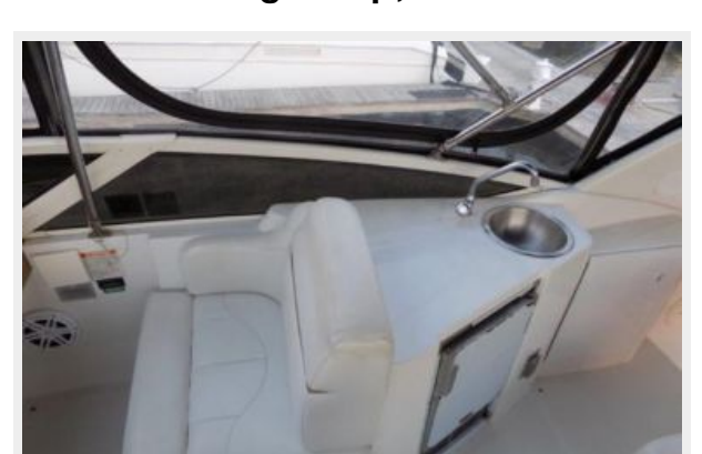
Carver 444 Cockpit Motor Yacht Companion Seating & Dary; Wet Bar