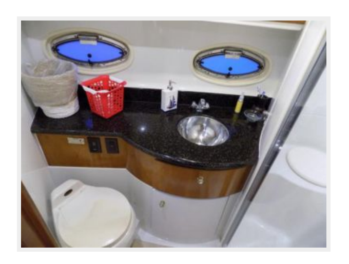
Carver 444 Cockpit Motor Yacht Master Head