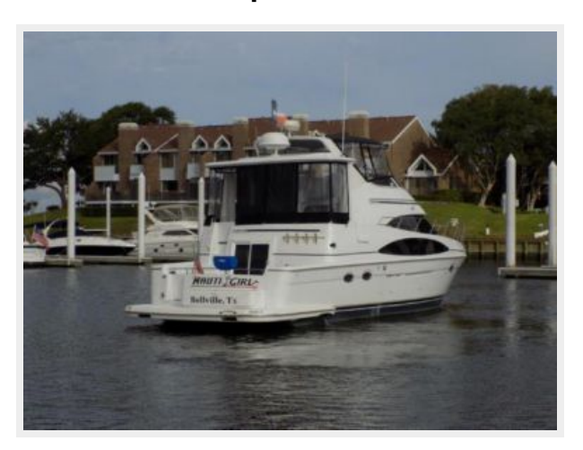
Carver 444 Cockpit Motor Yacht Port Profile