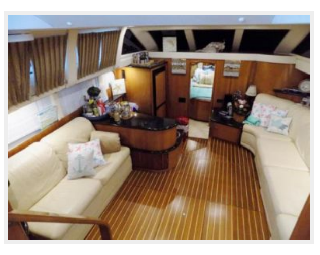
Carver 444 Cockpit Motor Yacht Salon