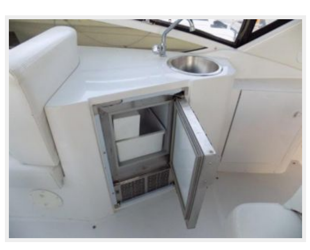
Carver 444 Cockpit Motor Yacht New Icemaker