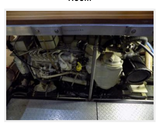
Carver 444 Cockpit Motor Yacht Engine Room