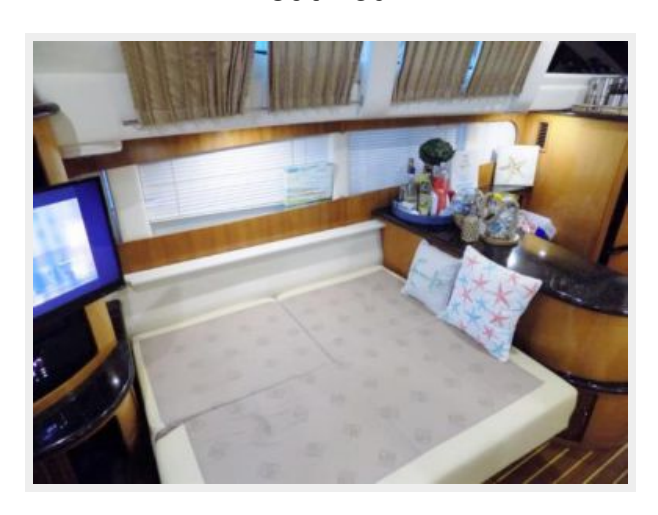
Carver 444 Cockpit Motor Yacht Salon Fold out Bed