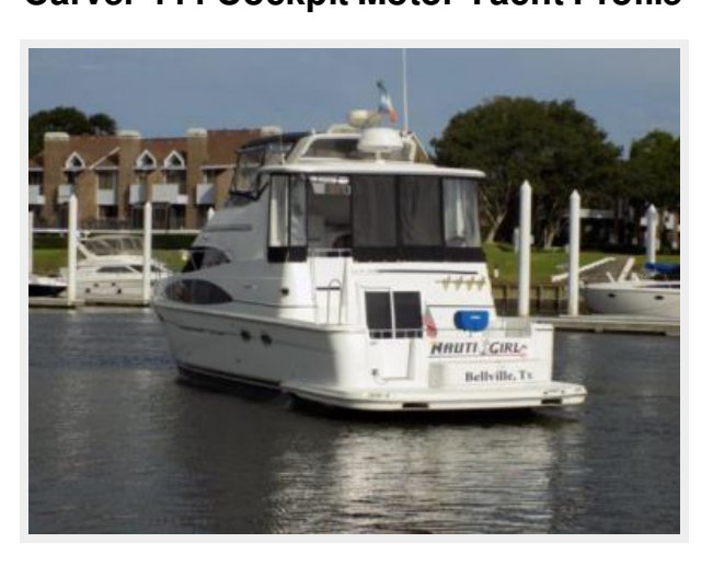
Carver 444 Cockpit Motor Yacht Profile