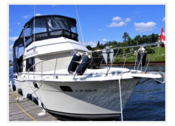
Starboard View at Dock