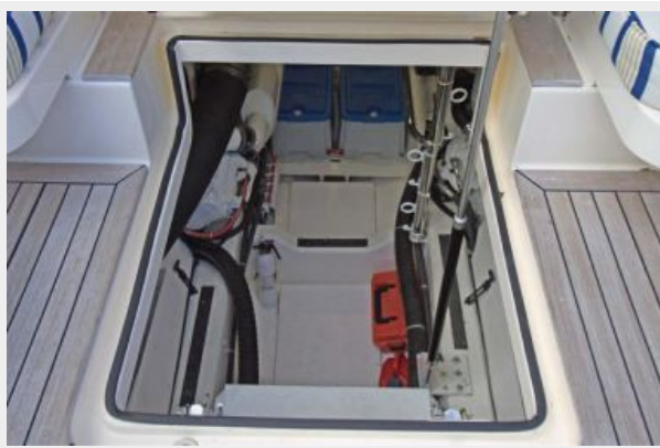
Engine Room Access