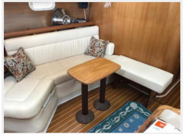
Main Salon with small table fitted (large table included).