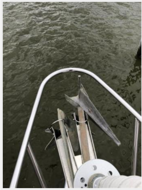
Double anchor rollers.