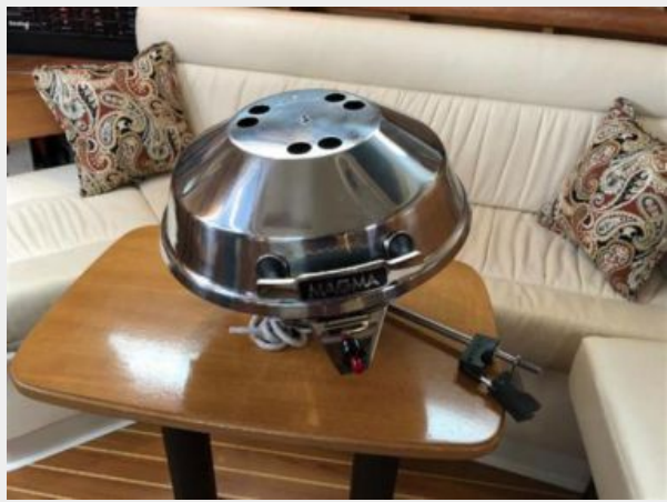
Included Magma grill (never used)