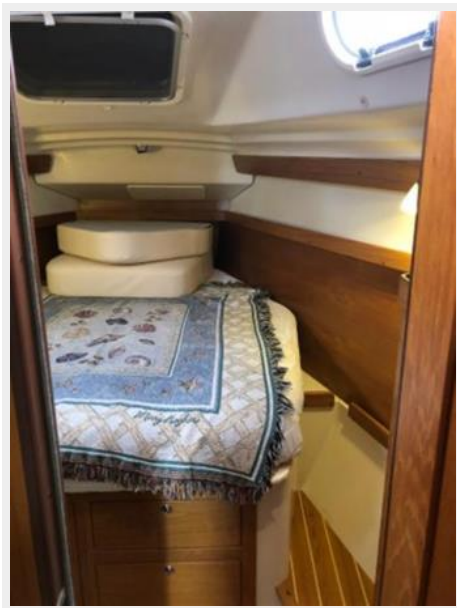
Forward cabin with Island berth