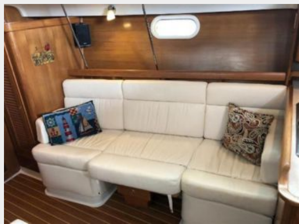
Starboard side set as settee