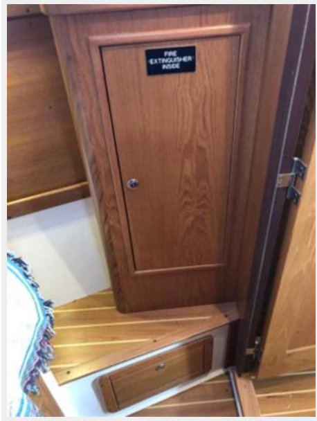
Forward cabin hanging locker -stbd