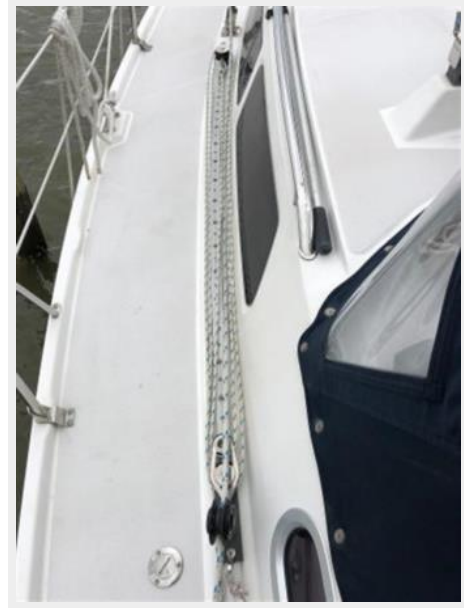
Bow/ electric windlass below deck.