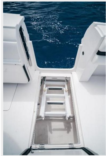
Fold-Out Swim Ladder