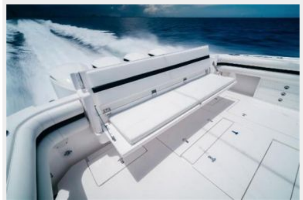
Folding Rear Bench Seat 2