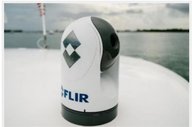
FLIR M324XP Nightvision Camera