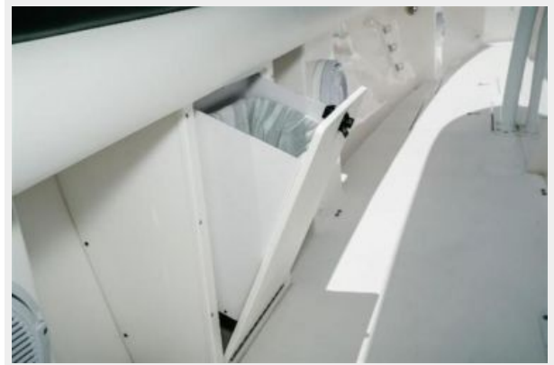
Hide-a-Way 12 Gallon Trash Bin