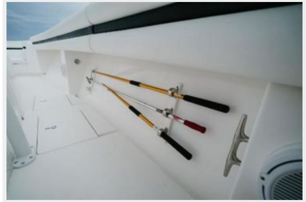
Stbd Rod Storage