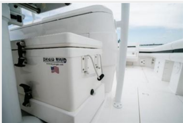
Frigid Rigid Slide-Out Cooler