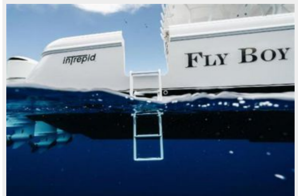
Swim Ladder 1