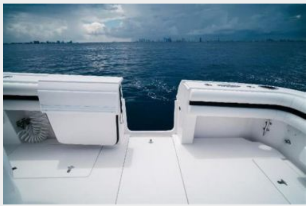
Swing-In Dive Door