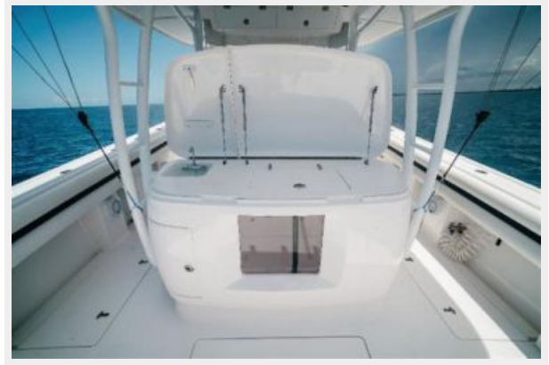
Powder-Coated Aluminum Ladder