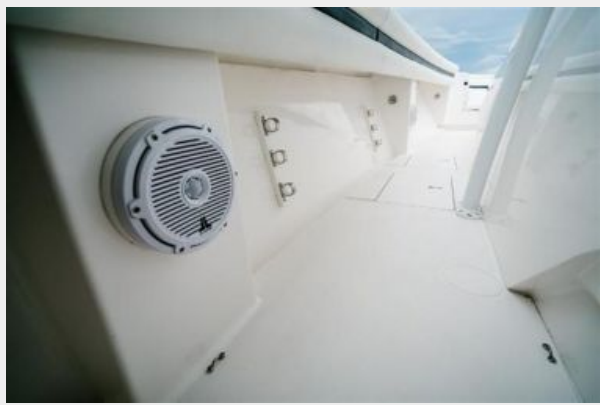
Port Rod Storage