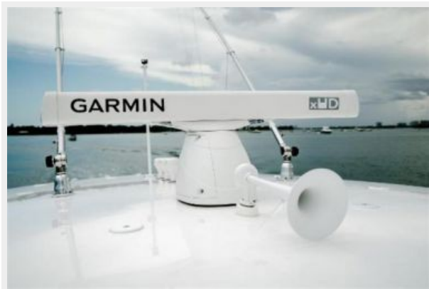
Garmin GMR604XHD Radar w/ 4' Array