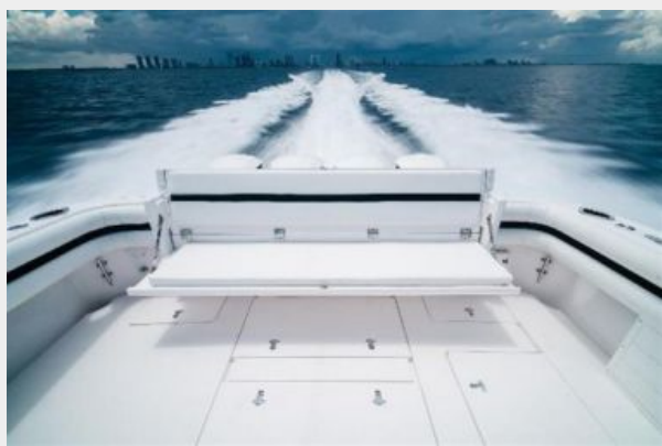
Folding Rear Bench Seat 1