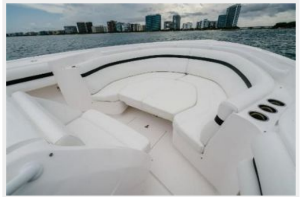
Bow Table Filler Piece