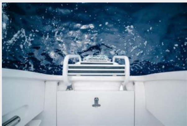
Swim Ladder Down