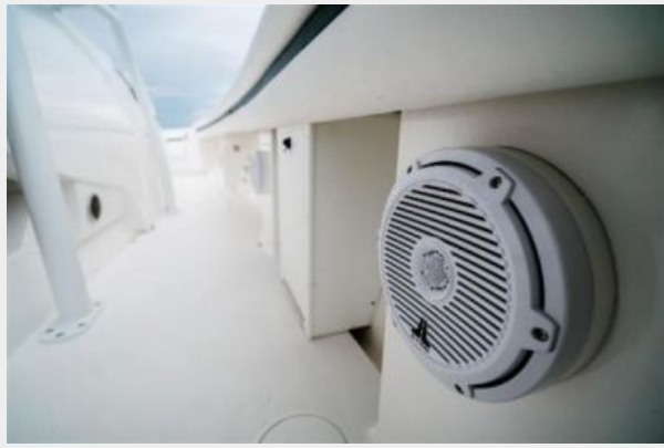
JL Audio System