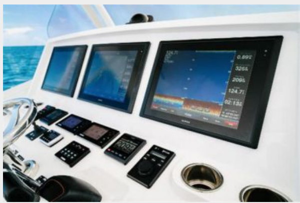
Garmin 8215 Displays