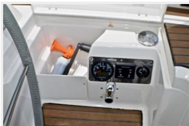
Engine port side