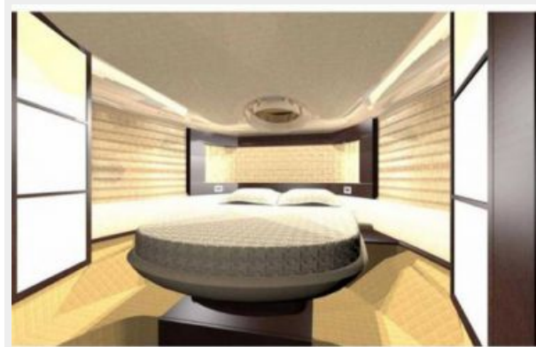
Manufacturer Provided Image: Owners Cabin