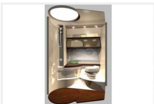
Manufacturer Provided Image: Owners Head