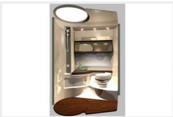
Owners Head