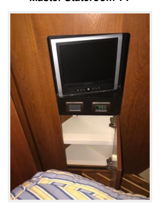
Master Stateroom TV