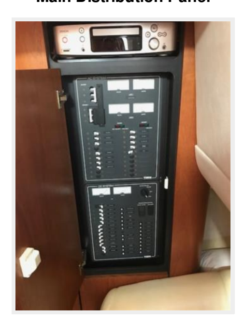
Main Distribution Panel