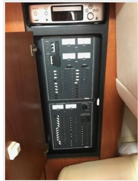
Main Distribution Panel