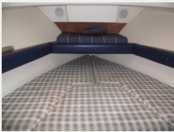
Main Cabin 1