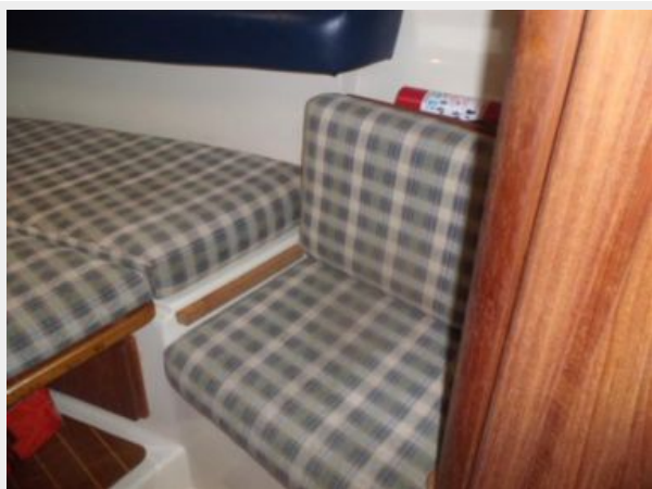
Main Cabin 3