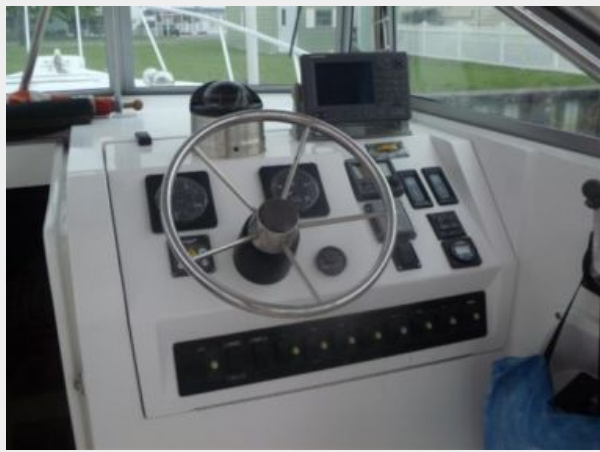
Helm / Electronics & Navigation 1