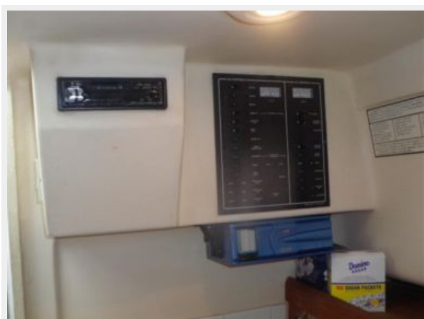
Electrical System / Equipment 1