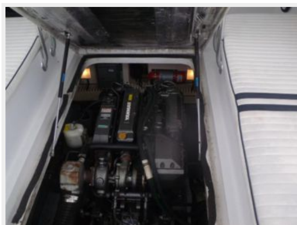
Engine & Mechanical Equipment