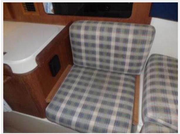
Main Cabin 2