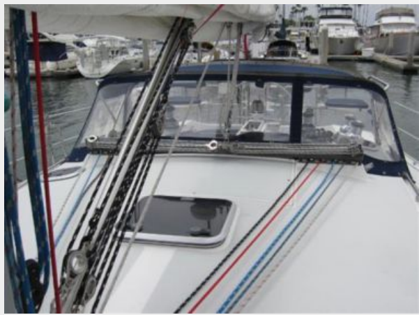
Solid Boom Vang