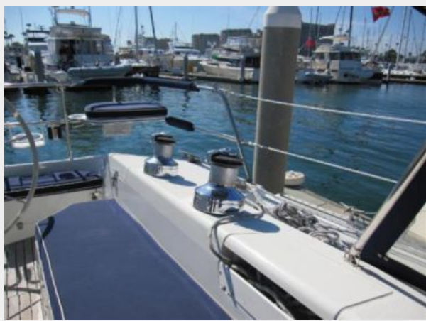
Electric Winches and Secondary Winches