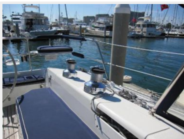
Electric Winches and Secondary Winches