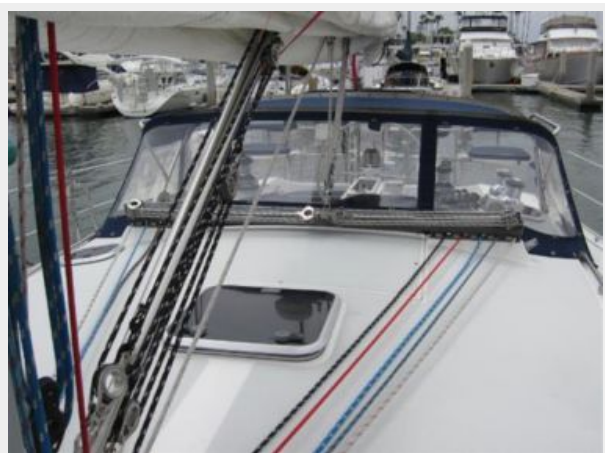
Solid Boom Vang