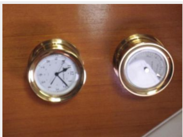
Clock and Barometer