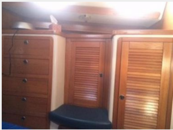
Master Cabin Lockers