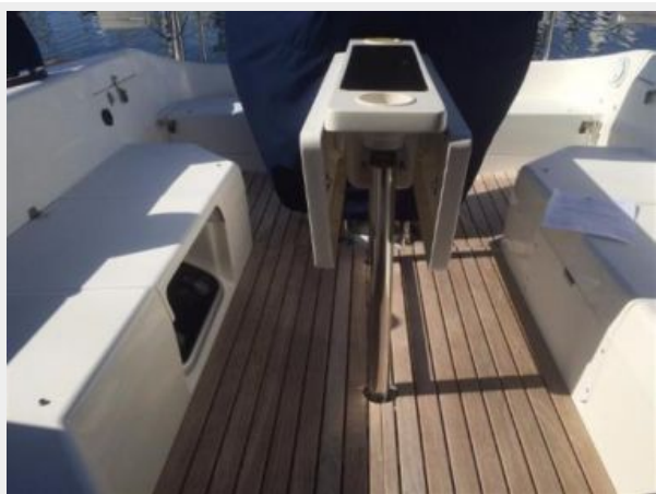
Teak Cockpit Grates