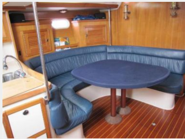
Dinette (w cover)and Settee