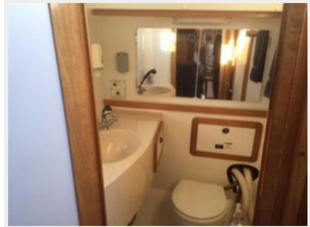
Guest / Day Head