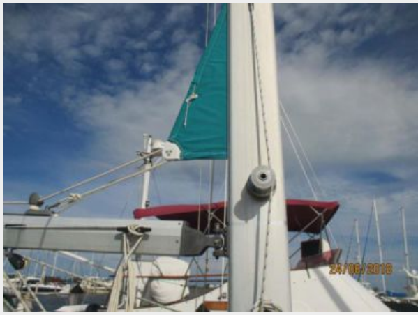
Sparcraft Roller Furling Main