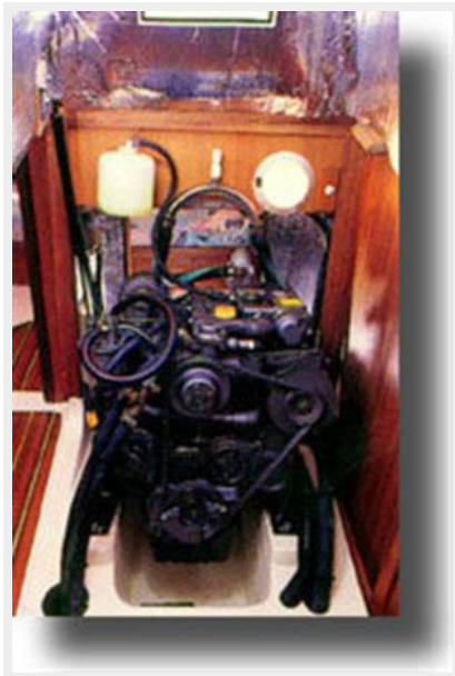
Stairs removed engine access