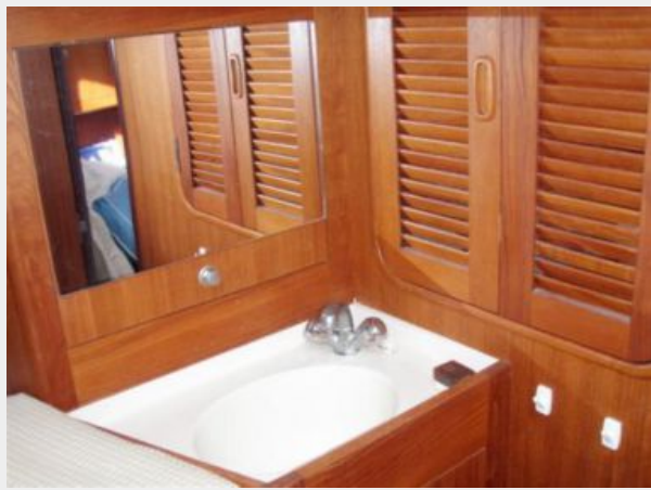
VIP Guest Cabin w Vanity