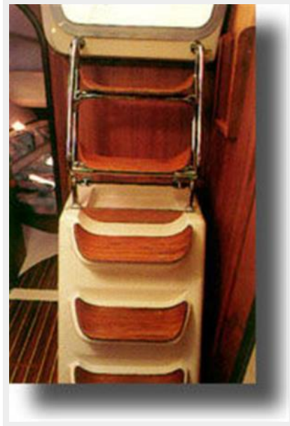
Companion Way Stairs