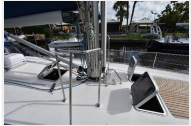
Mast pulpit for safety