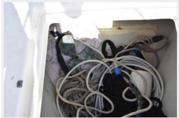
Large Deck storage locker