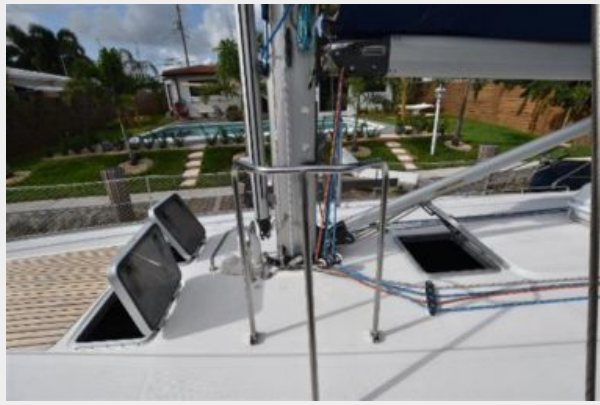
Lots of ventilation