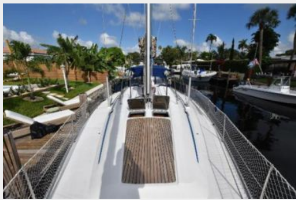
Wide side decks