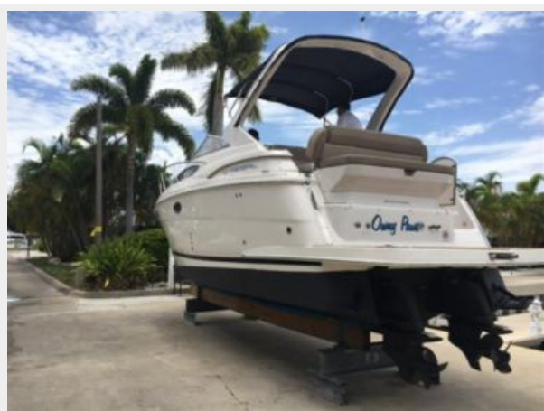
Port stern view on rack