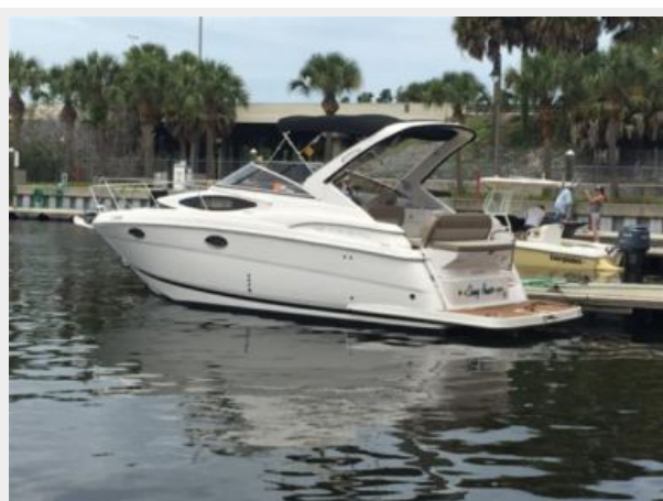
Port Profile at Dock