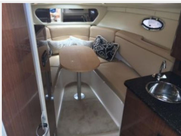
Cabin facing forward