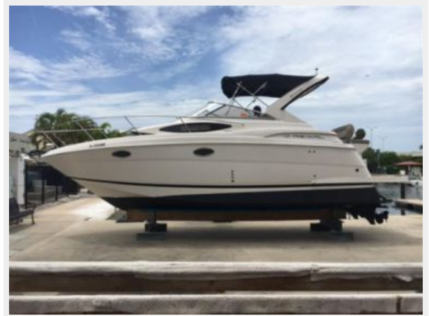
Port Profile on rack