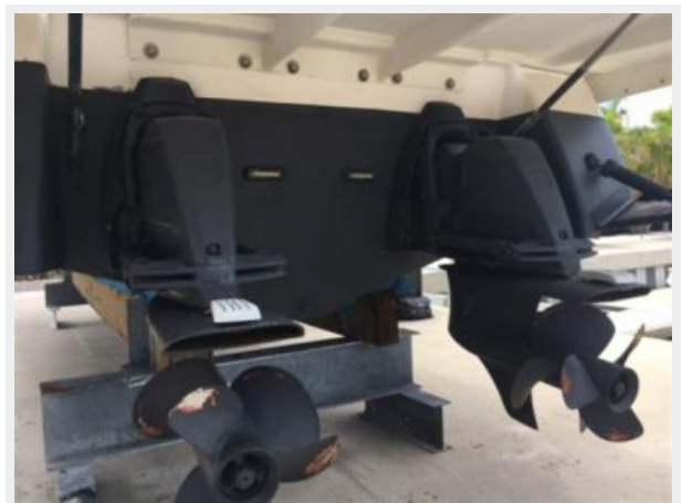
Outdrives/ Underwater Lights