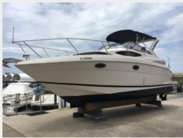
Port profile on rack