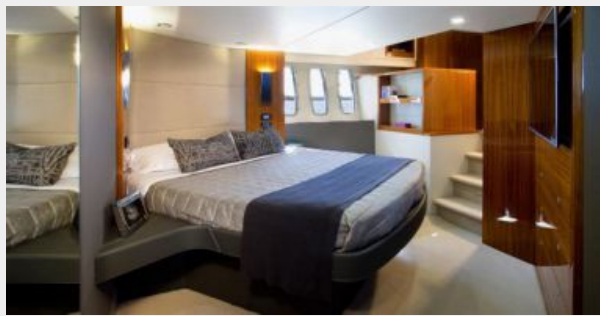
Maritimo M59 Master Stateroom