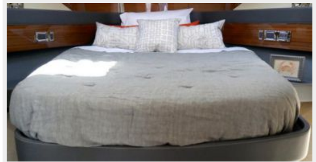
Maritimo M59 VIP Stateroom