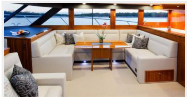
Maritimo M59 Salon