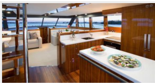
Maritimo M59 Galley