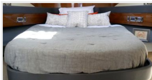
Maritimo M59 VIP Stateroom