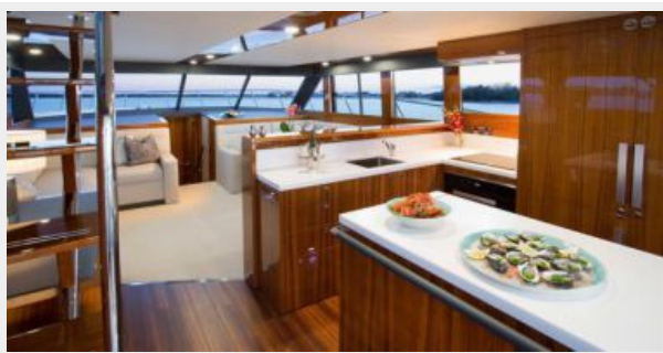
Maritimo M59 Galley