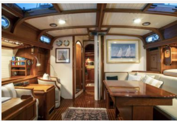
Main Salon, Looking Fwd.