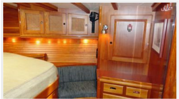
Owner's Cabin, Stbd.