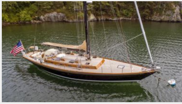
Aerial View, Fwd.