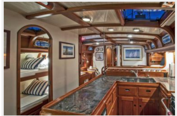
Interior, Looking Fwd.