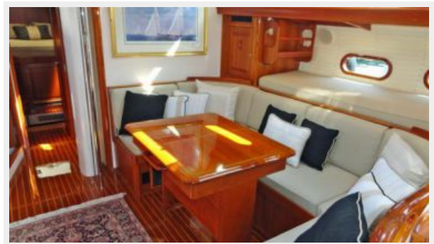
Main Salon, Stbd.