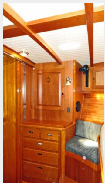
Owner's Cabin, Port