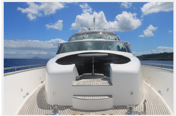
Bow Seating with Cushions, Table and Umbrella