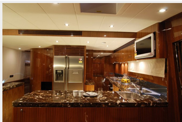
Full Size Galley