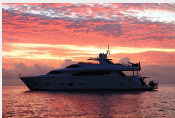
Cruising into the Sunset