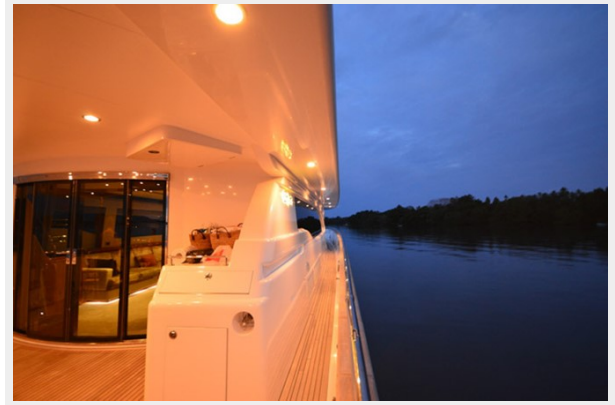
Stern Aft Quarter