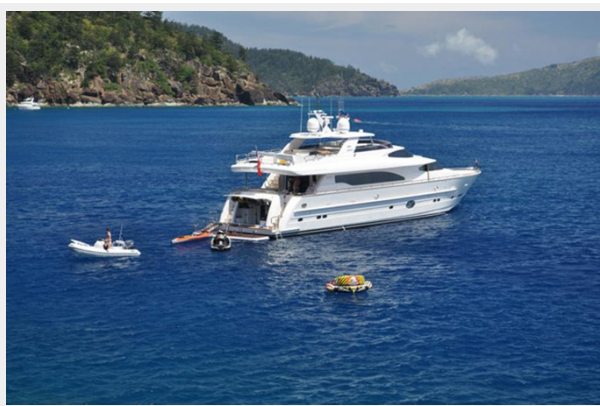
Full Size Stern Door Garage Access