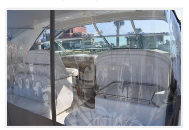
Sea Ray 37 Express Cruiser