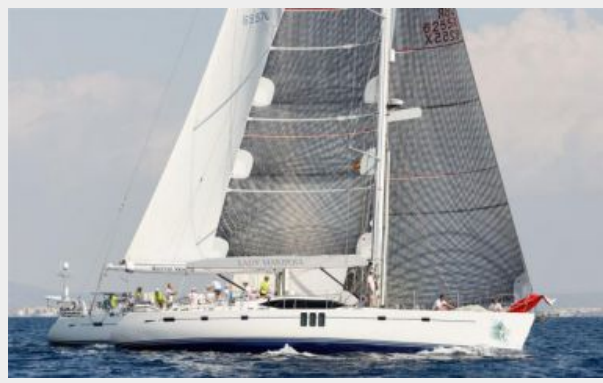
LADY MARIPOSA - 18.jpg