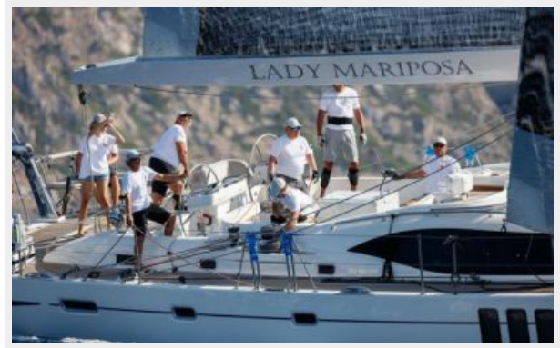
LADY MARIPOSA - 17.jpg