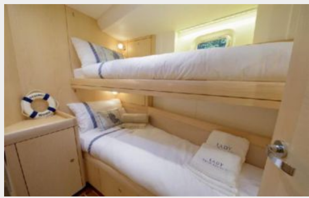
LADY MARIPOSA - 5.jpg