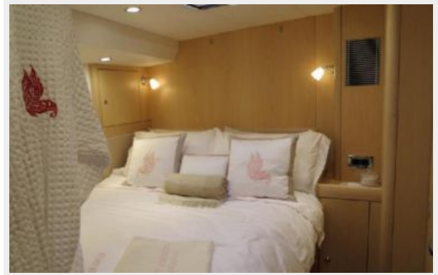
LADY MARIPOSA - 4.jpg