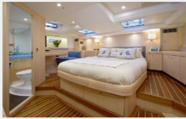
LADY MARIPOSA - 3.jpg