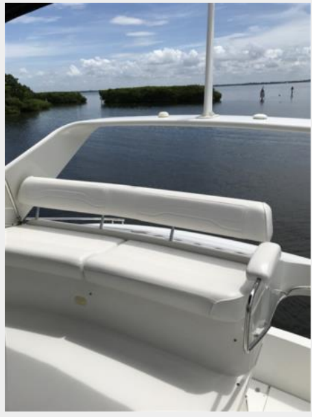
360 Carver SS - Aft Bench Seat and Storage