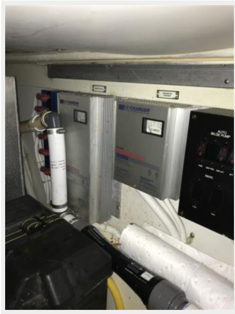
360 Carver SS - Engine Room Battery Chargers