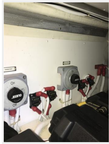
360 Carver SS - Engine Room Battery Switches