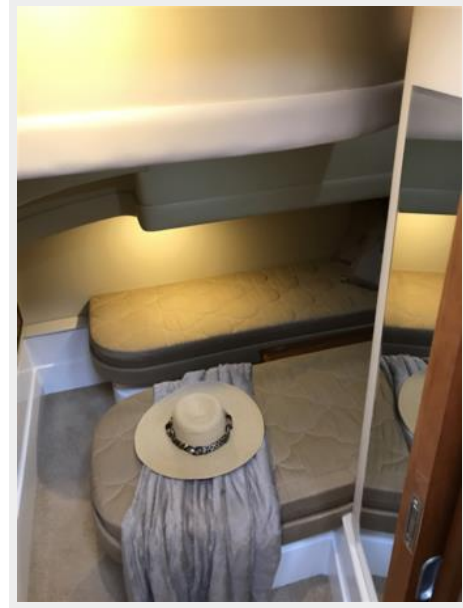
360 Carver SS - Guest Stateroom