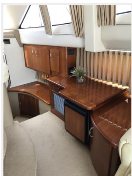
360 Carver SS - Salon