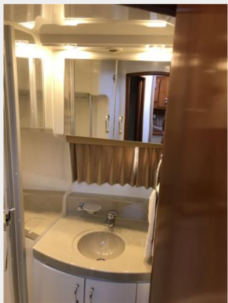
360 Carver SS - Master Head