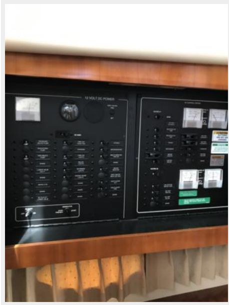
360 Carver SS - Distribution Panel