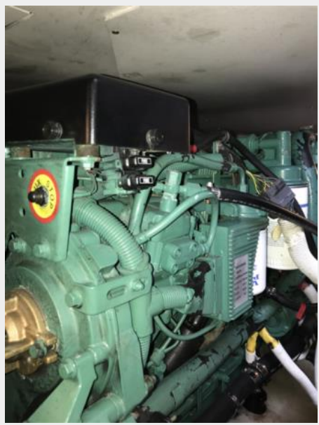
360 Carver SS - Engine Room