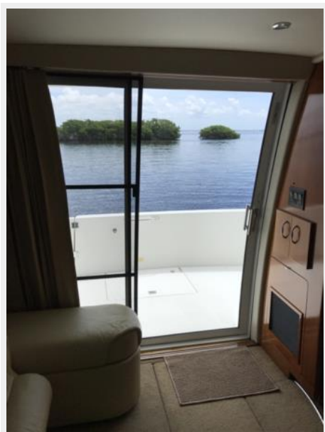
360 Carver SS - Salon Entry