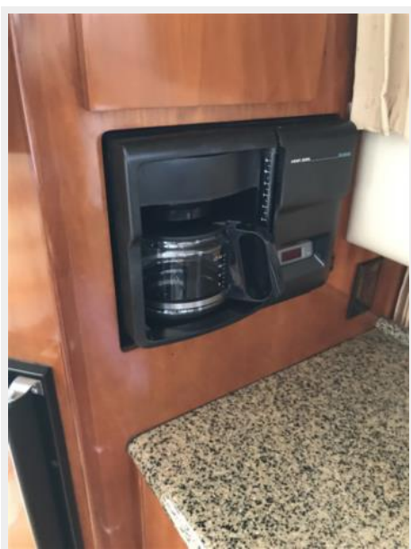
360 Carver SS - Coffe Maker