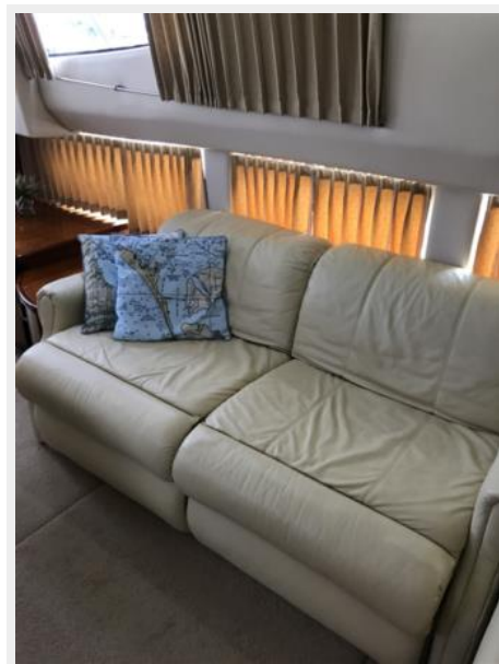
360 Carver SS - Salon Couch