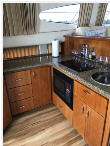
360 Carver SS - Galley