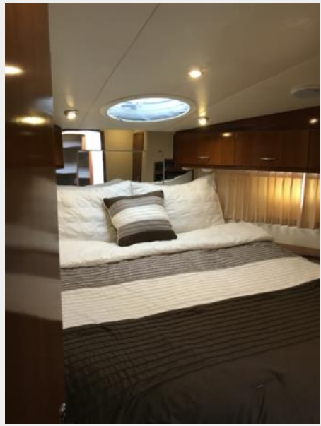
360 Carver SS - Master Stateroom