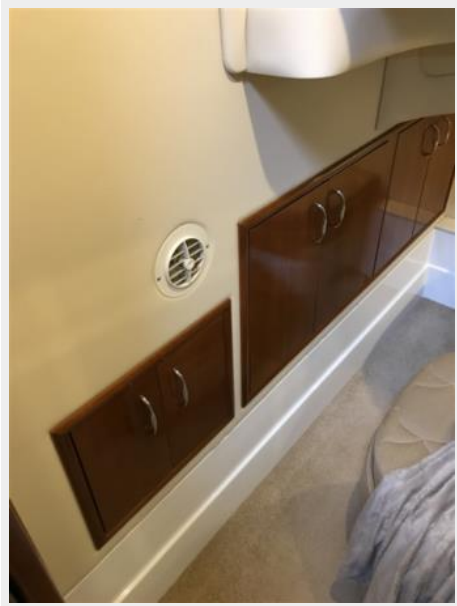
360 Carver SS - Guest Stateroom Storage