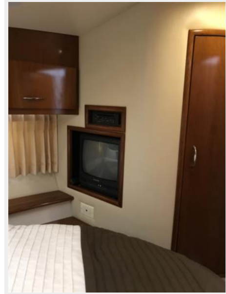
360 Carver SS - Master Stateroom TV