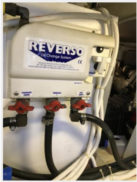
360 Carver SS - Engine Room Oil Changer