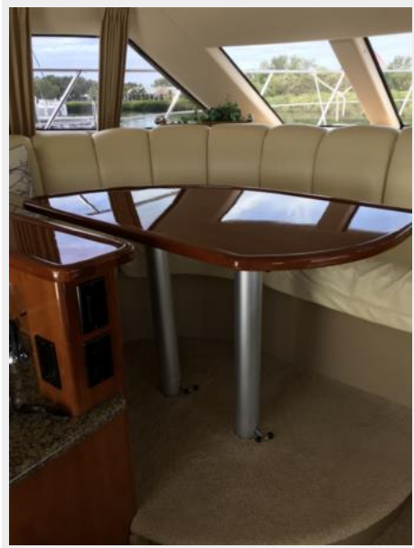
360 Carver SS - Dinette