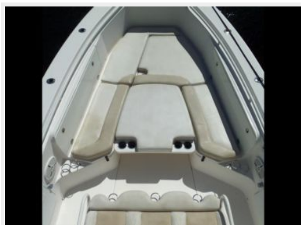
Sun Lounge Position