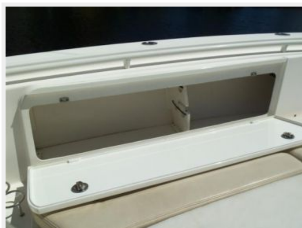
Port & Starboard Rod Storage