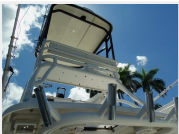
Tower Buggy Top