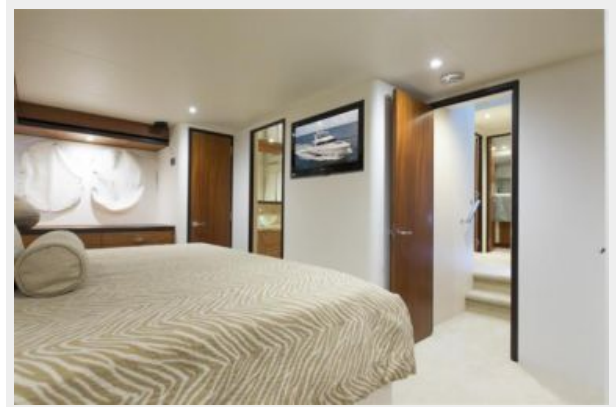
TV in the master stateroom