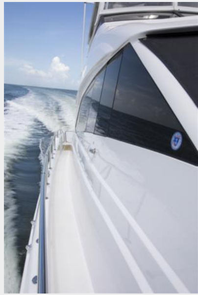
STBD side deck