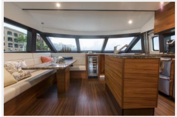
Dinette view 2