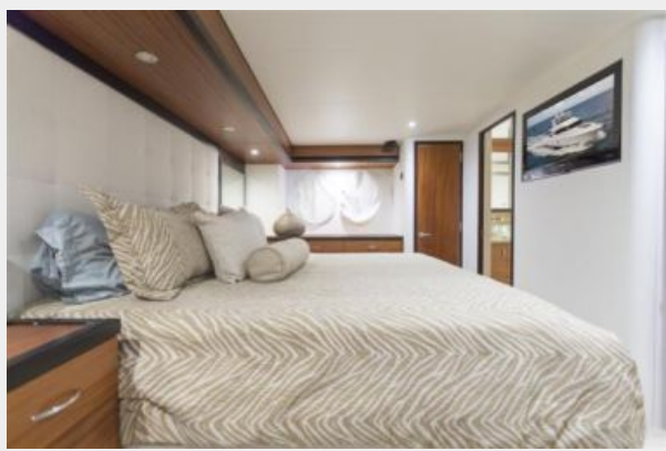
Master stateroom view 3