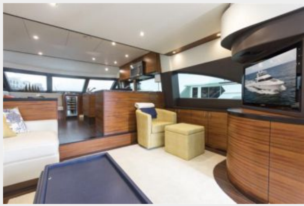
Salon view 2