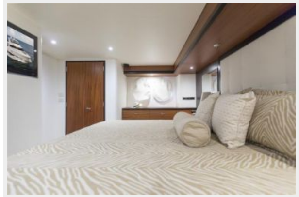
Master stateroom view 2