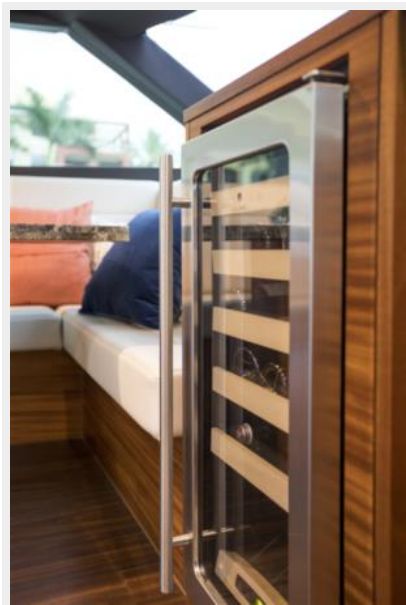
Galley wine cooler