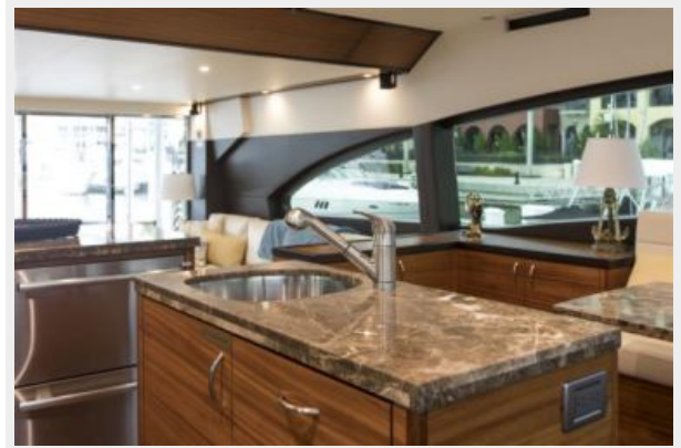
Sink in the galley