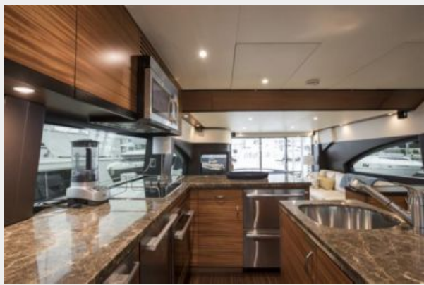
Galley looking aft