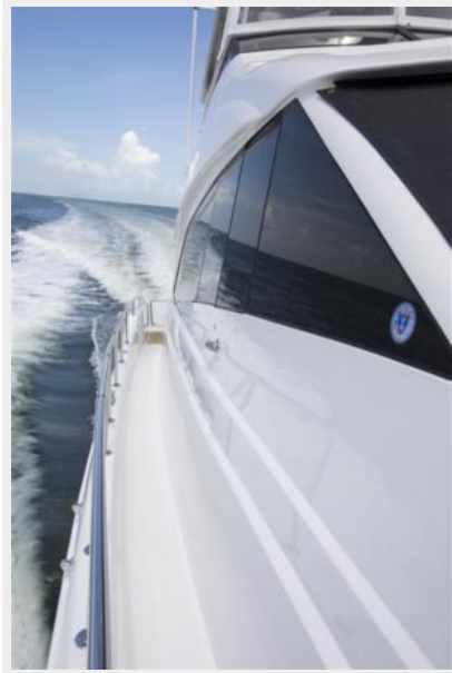
STBD side deck