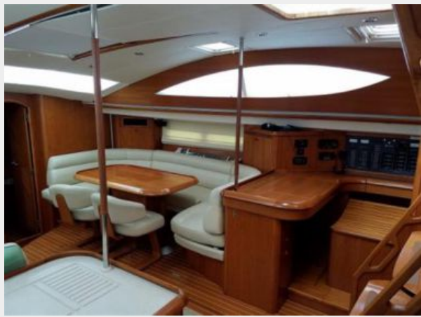
Salon Dinette on Stbd