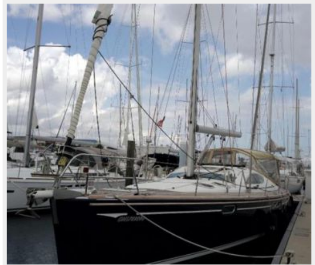
Custom Asymmetrical Sprit