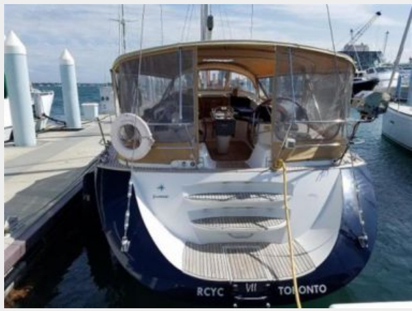
Easy Access Transom