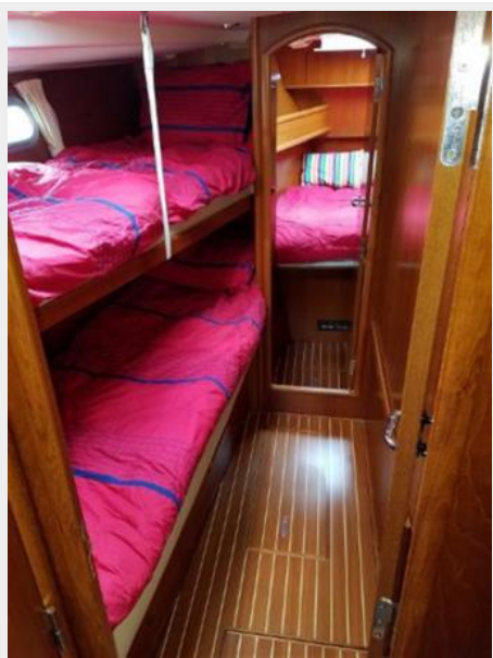
Lateral Guest Berths on Port