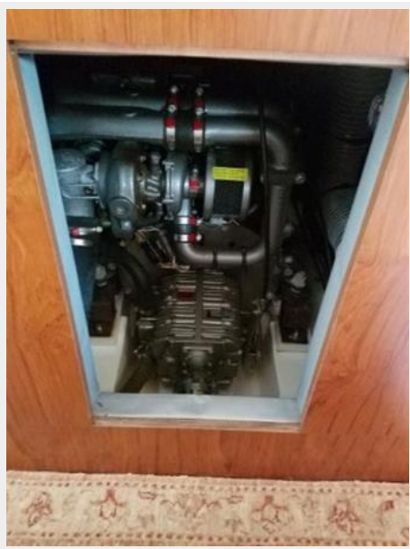
Engine Compartment Aft Cabin Access