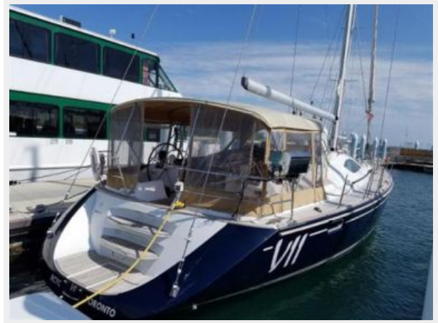
Stb Side Hull