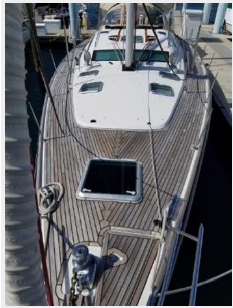
Beautiful Teak Deck