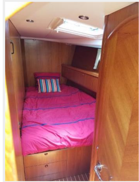
VIP Guest Cabin to Stbd