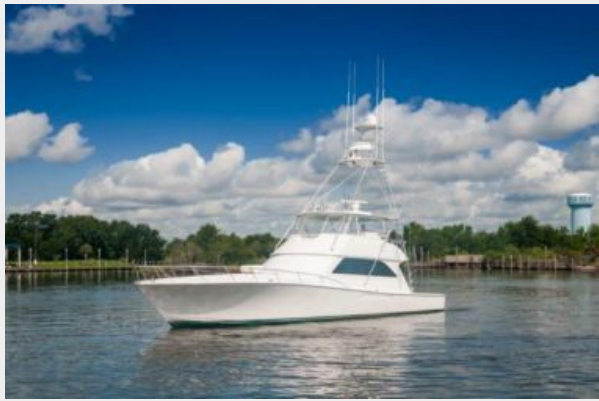
Viking 65 Convertible Port Profile