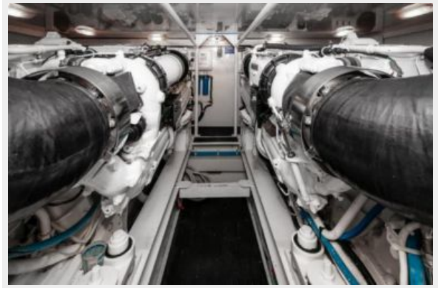
Viking 65 Convertible Engine Room