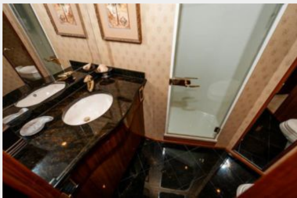
Viking 65 Convertible Master Head