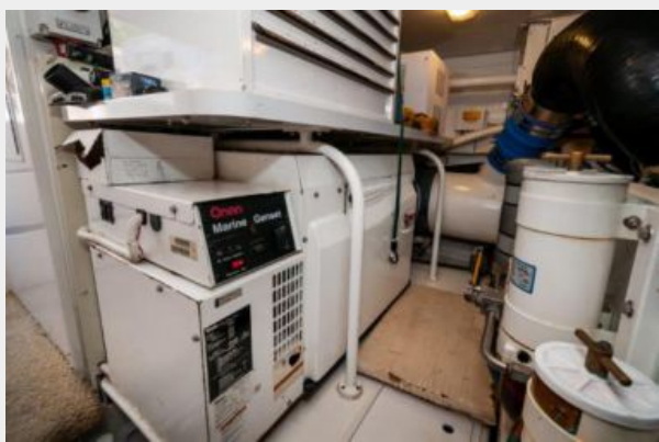
Viking 65 Convertible Port Generator