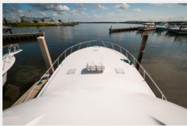
Viking 65 Convertible Bow