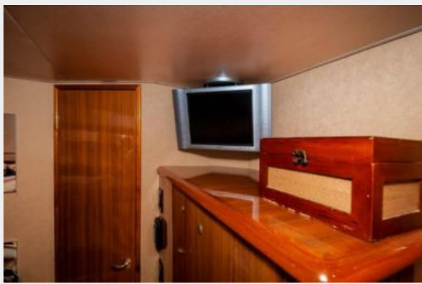
Viking 65 Convertible Crew Quarters TV