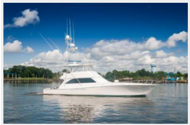
Viking 65 Convertible Starboard Profile