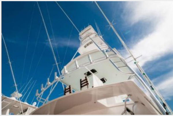
Viking 65 Convertible Tower