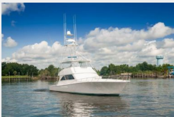
Viking 65 Convertible Starboard Bow