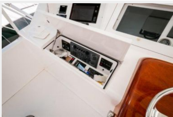
Viking 65 Convertible Helm