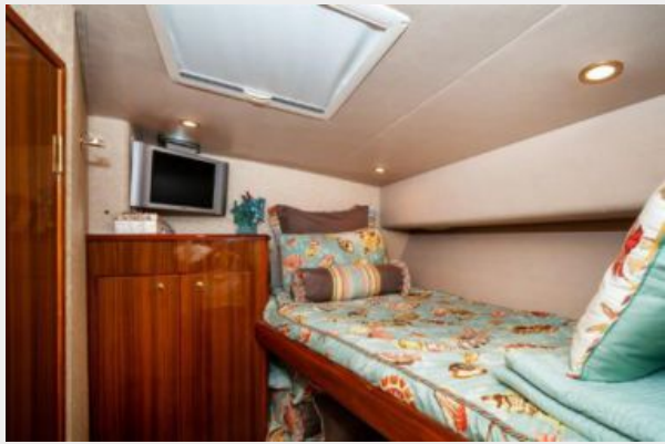
Viking 65 Convertible Bunk Room