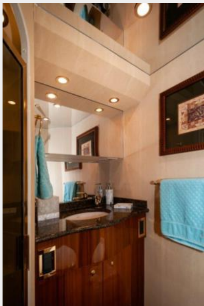
Viking 65 Convertible Crew's Head