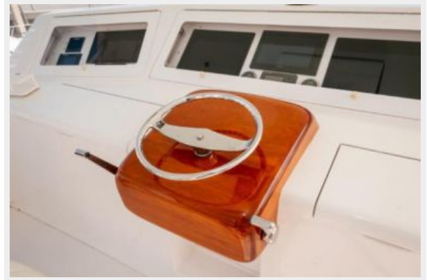
Viking 65 Convertible Helm