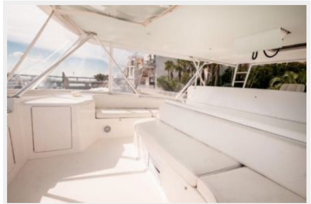
Viking 65 Convertible Flybridge