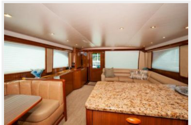
Viking 65 Convertible Salon