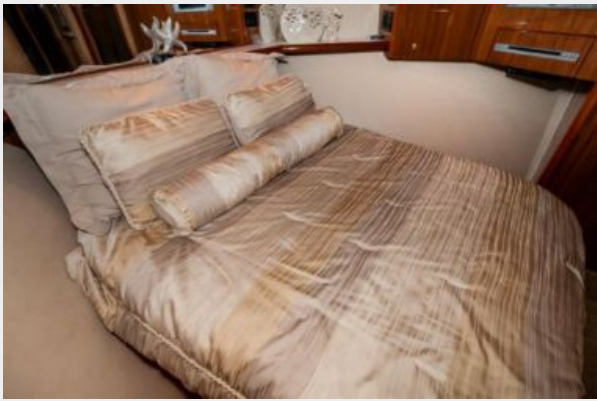
Viking 65 Convertible VIP Stateroom