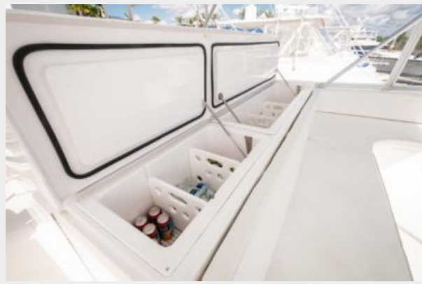
Viking 65 Convertible Flybridge