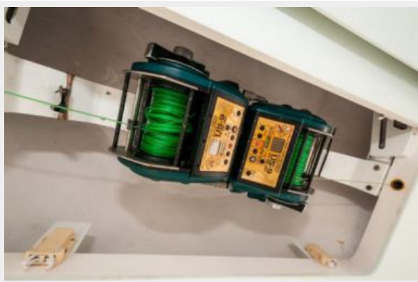
Viking 65 Convertible Teaser Reels