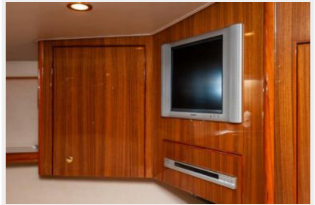
Viking 65 Convertible VIP Stateroom TV