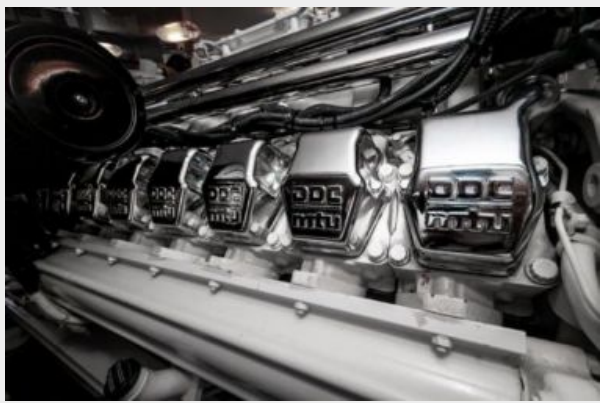
Viking 65 Convertible Valve Covers