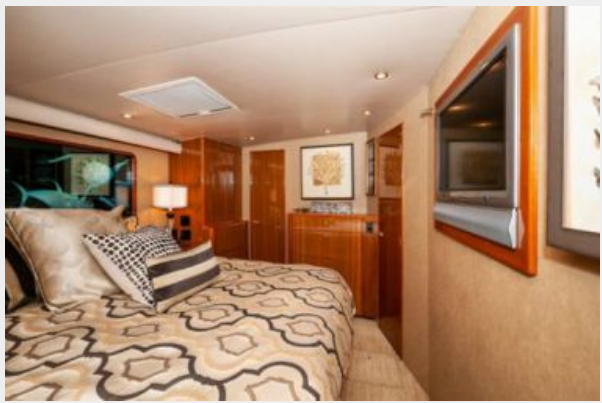
Viking 65 Convertible Master Stateroom