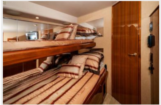
Viking 65 Convertible Crew's Quarters