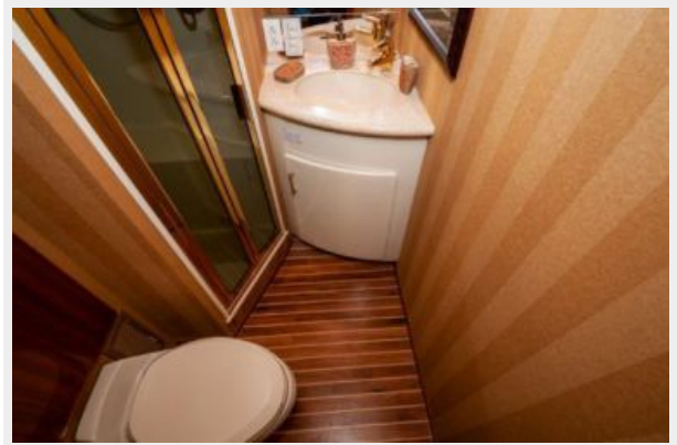
Viking 65 Convertible Crew Head