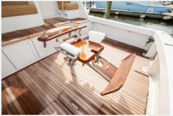
Viking 65 Convertible Cockpit