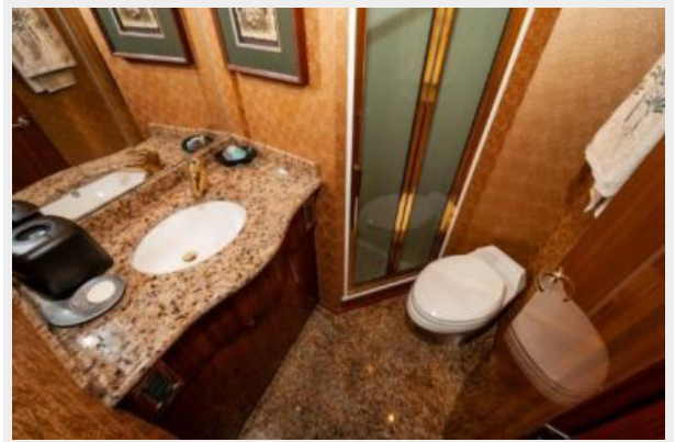
Viking 65 Convertible VIP Head