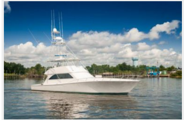
Viking 65 Convertible Starboard Bow