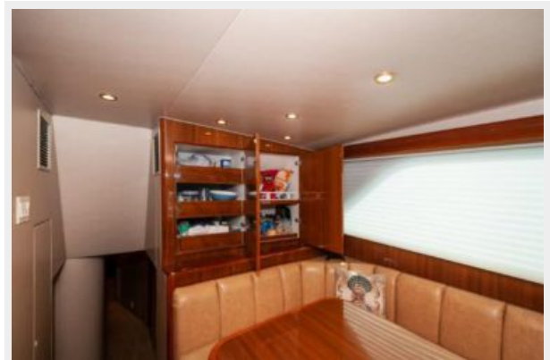
Viking 65 Convertible Dinette Storage