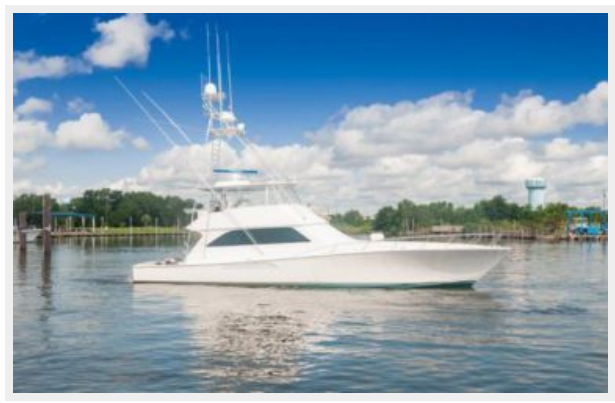
Viking 65 Convertible Starboard Profile