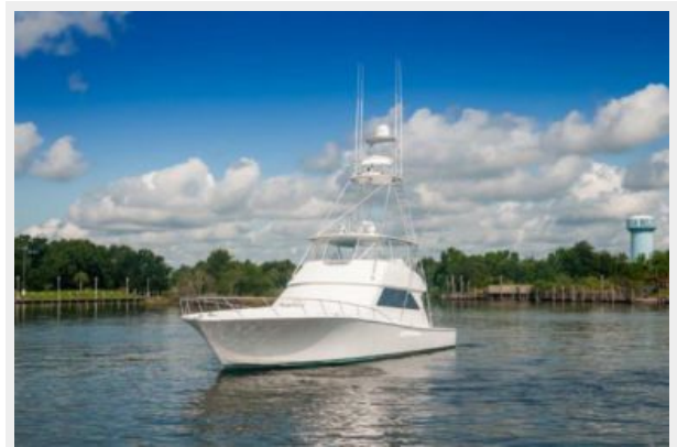
Viking 65 Convertible Port Bow