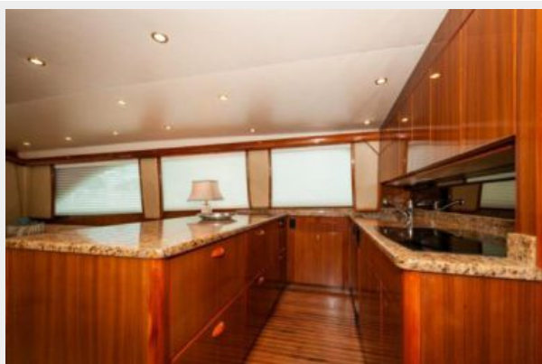
Viking 65 Convertible Galley