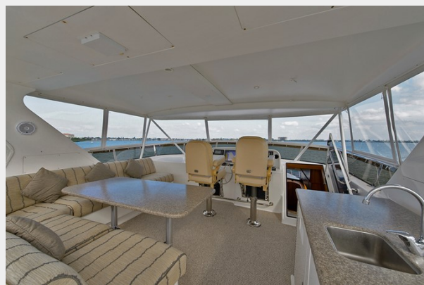
Air Conditioned Flybridge