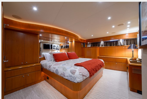
Full Beam Master Stateroom