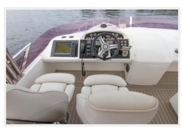
FB Helm Seating