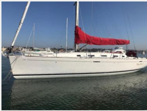
Heartbeat in Standard Configuration