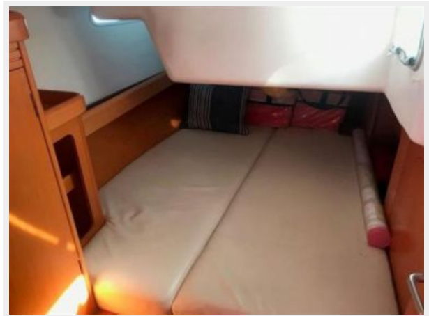
Starboard Aft Stateroom with Double Berth