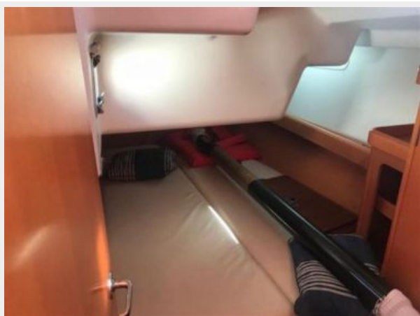
Port Aft Stateroom with Double Berth