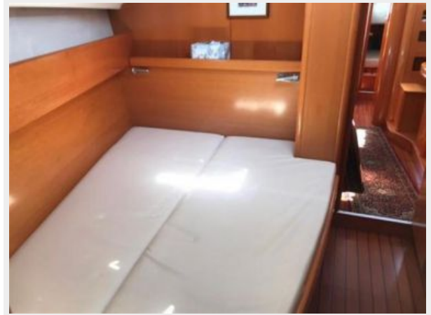
Foward Double Berth