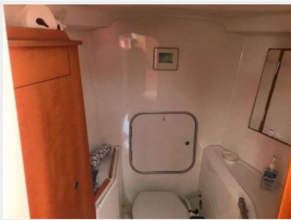
Forward Ensuite Head