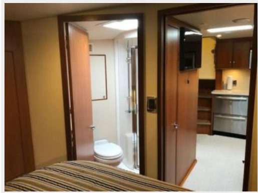
Master View Aft to Head and Sink