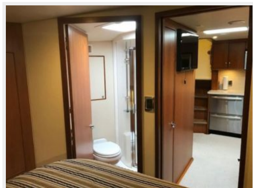
Master View Aft to Head and Sink