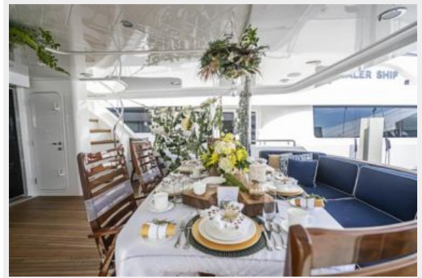
Aft Deck / Dining