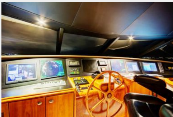
Pilothouse / Helm