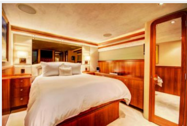
Guest Stateroom / Port