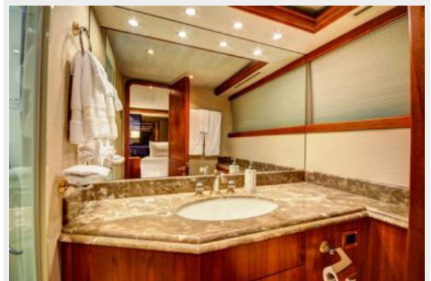
Guest Head / Starboard