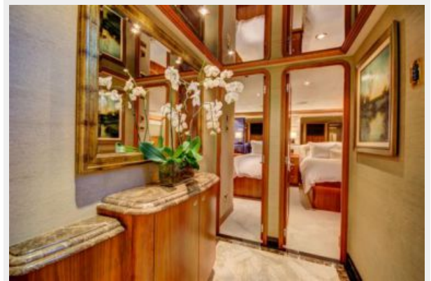
Foyer to Guest Staterooms