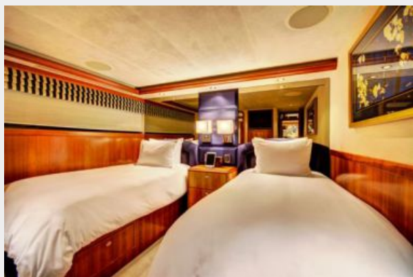
Guest Stateroom / Starboard