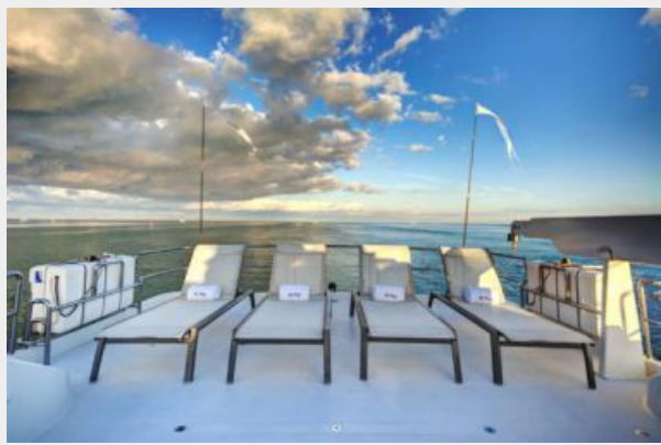
Sun Deck / Boat Deck