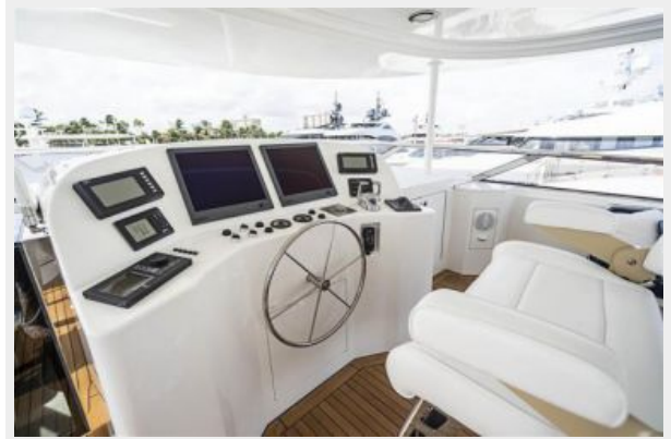
Flybridge / Helm