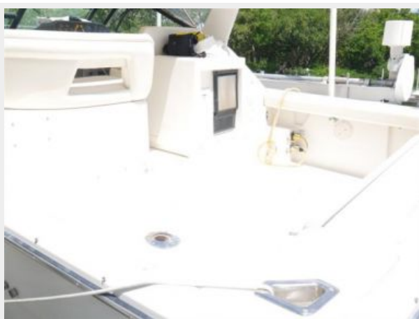
1992 Tiara 31 Coupe - Cockpit