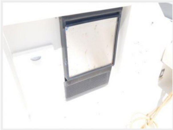
1992 Tiara 31 Coupe - Starboard Fridge