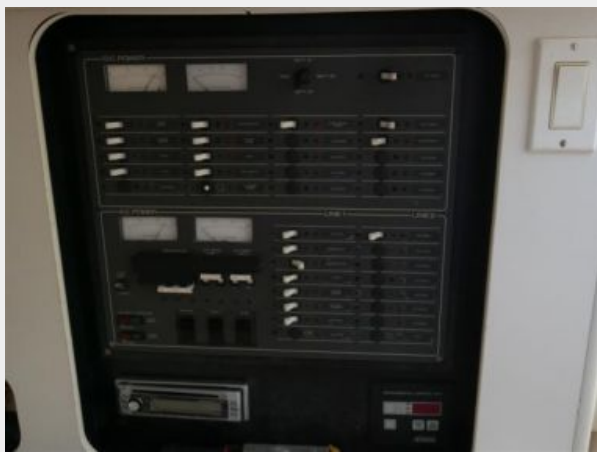
1992 Tiara 31 Coupe - Electrical