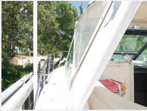
1992 Tiara 31 Coupe - Port Side Profile