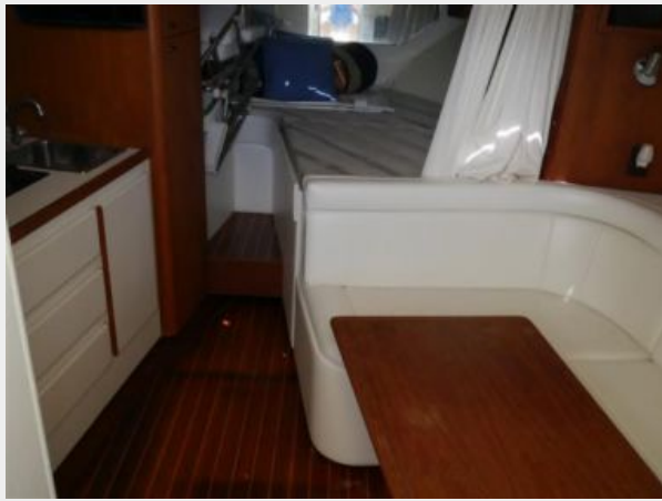
1992 Tiara 31 Coupe - Cabin