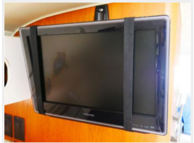
1992 Tiara 31 Coupe - Flatscreen TV