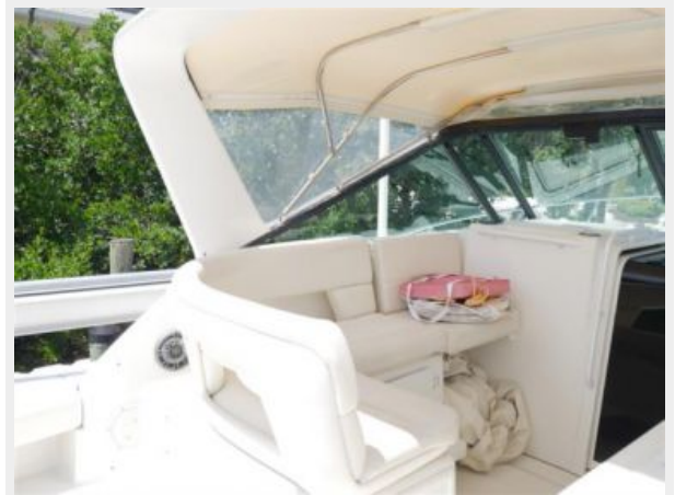
1992 Tiara 31 Coupe - Forward Port Side Seating