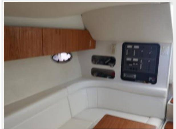
1992 Tiara 31 Coupe - Dinette