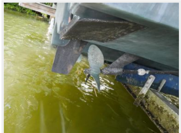
1992 Tiara 31 Coupe - Props