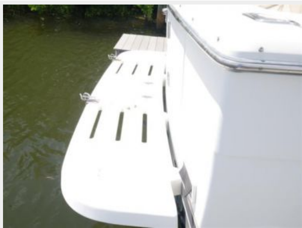
1992 Tiara 31 Coupe - Transom