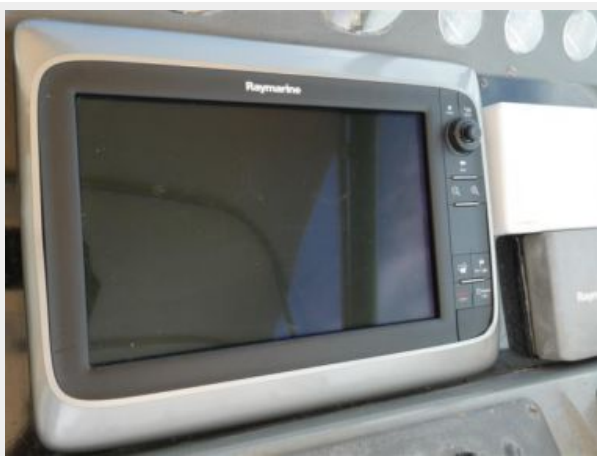
1992 Tiara 31 Coupe - Helm