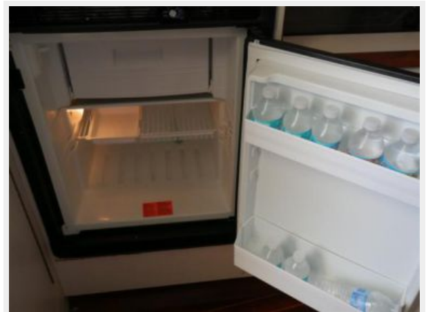
1992 Tiara 31 Coupe - Galley