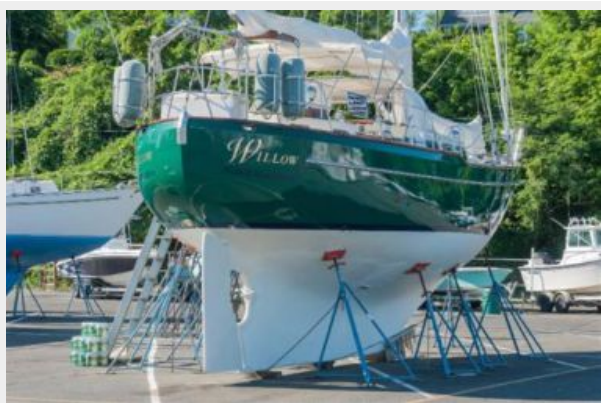
Rounded Powerful Hull & lines