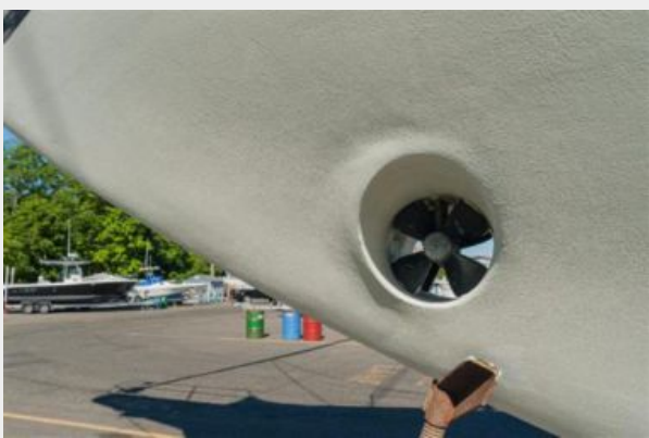
Twin prop tunnel thruster