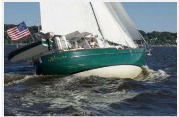
Custom paint on hull and tender