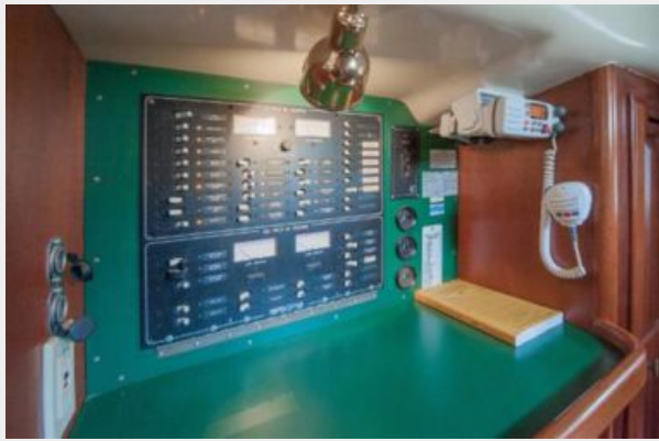
Nav. Station Primary Elec Panel