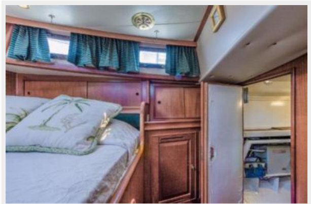
Aft Cabin Engine Room Entry