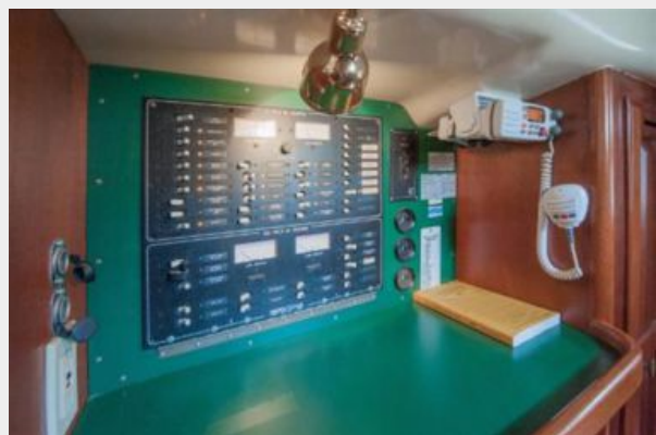
Nav. Station Primary Elec Panel