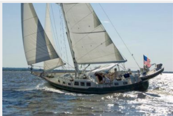
Genoa - club boom staysail - full batten Main