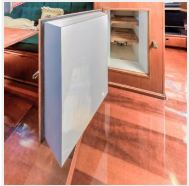
Top & Front loading refer & Freezer