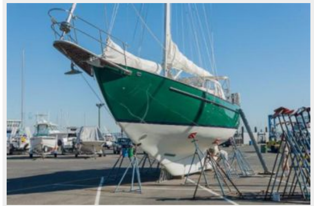
Fine entry and graceful lines