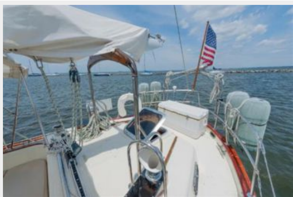
Boom Gallows & Large Cooler aft deck