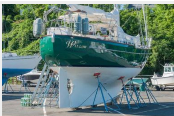
Rounded Powerful Hull & lines