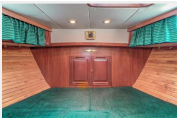
Forward Cabin w/ chain locker access