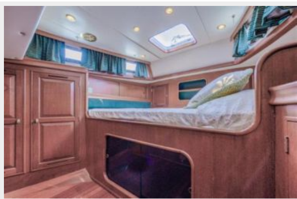
Aft Cabin from Port side - Storage