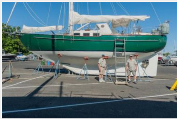
6 foot draft with classic look of quality