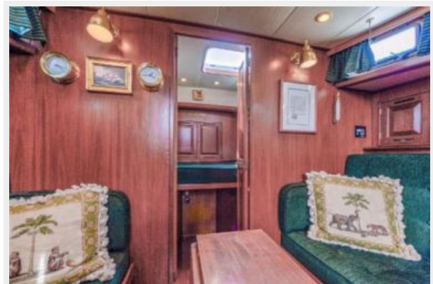
Salon looking to Forward Cabin