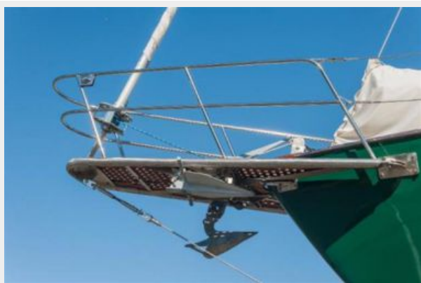
Custom heavy stainless Bow roller