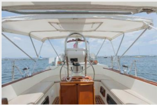
NEW Dodger and Bimini & inserts