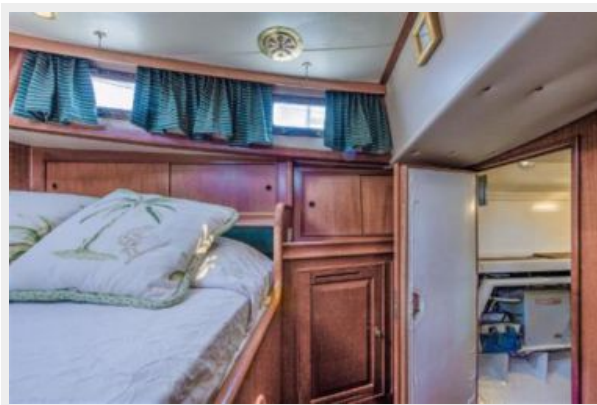
Aft Cabin Engine Room Entry