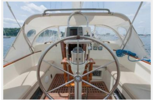
Protected comfortable large Cockpit