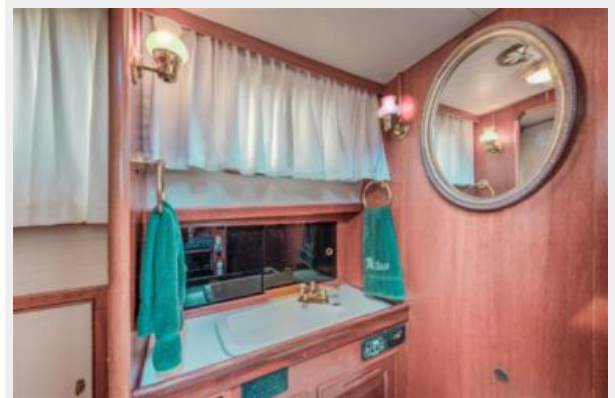
Large Central Head & Stall Shower