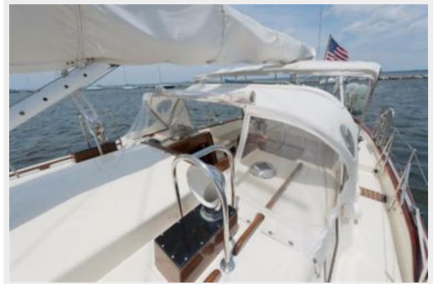
Removeable Isinglass inserts