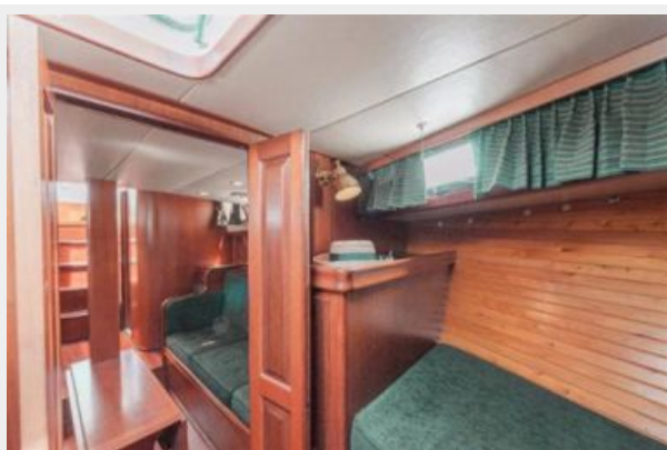
Forward Cabin looking aft to Port