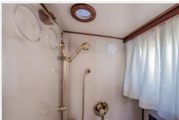
Large Stall Shower -fresh water Vacuflush Head