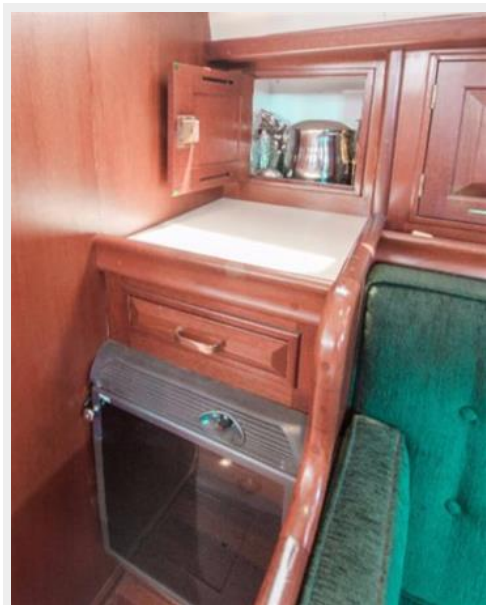
Salon 12V refer & Bar Storage