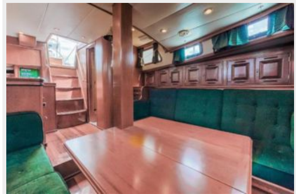
Salon Table open - seat 6