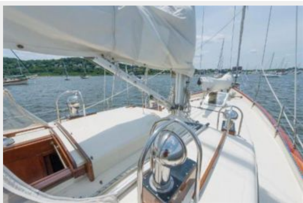
Clean well planned foredeck