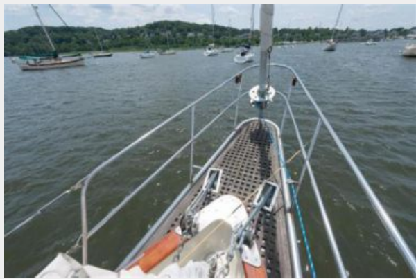
Uncluttered Bow Platform & Furling