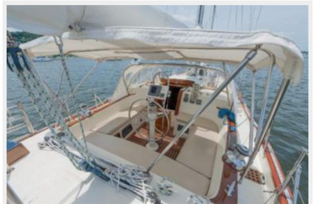
Good access to controls in Cockpit