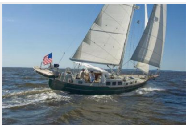
Easily driven hull and SAFE sailor