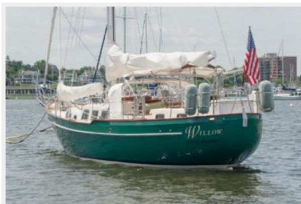
Classic beauty from all sides