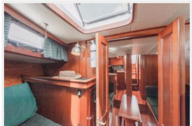
Forward Cabin looking aft - Starboard