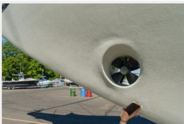
Twin prop tunnel thruster