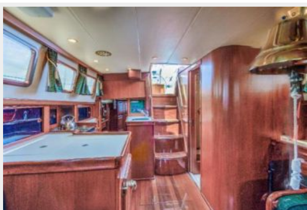
Salon looking at Companion Way