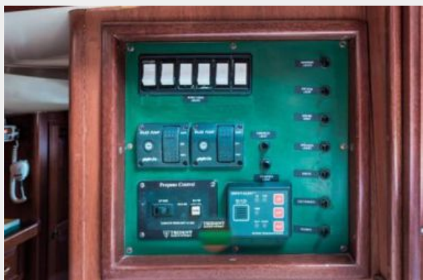
2nd Sub panel at Entry, lights & Bilge