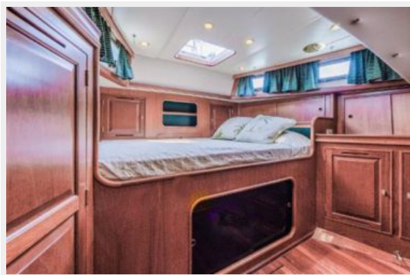
Aft Cabin from Starboard w/ real Mattress