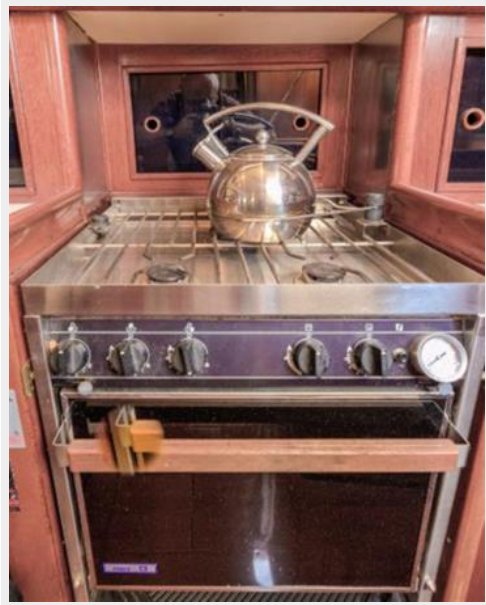
Beautiful Gimbal Stove & Oven