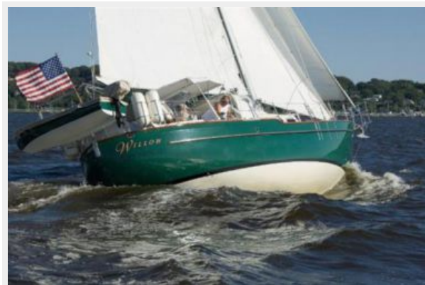
Custom paint on hull and tender