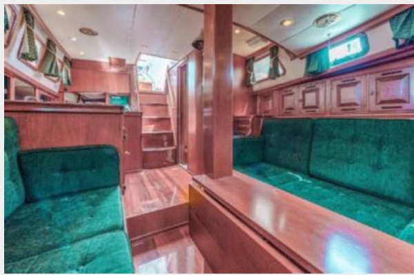
Salon Large folding table - centerline