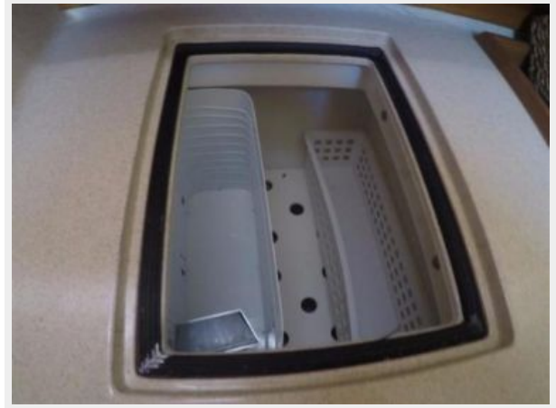
Top and front loading fridge