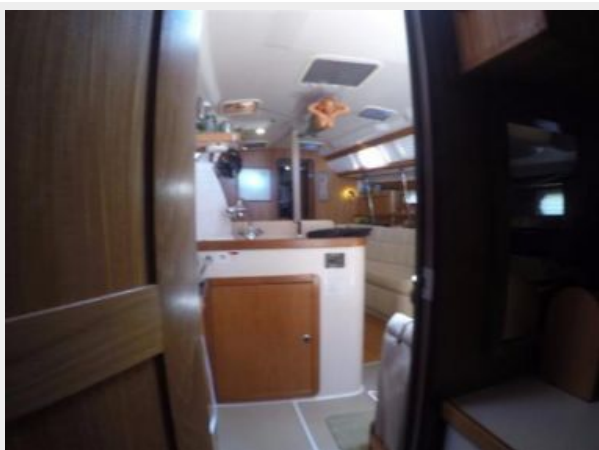
Aft Stateroom Access