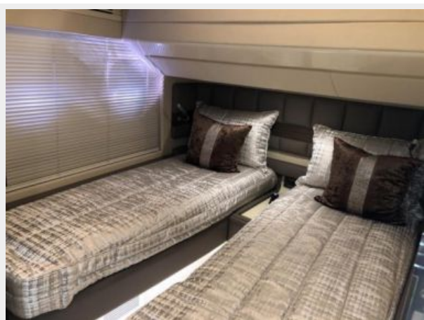
64 Azimut VIP Stateroom 1