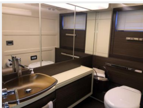
64 Azimut Master Head