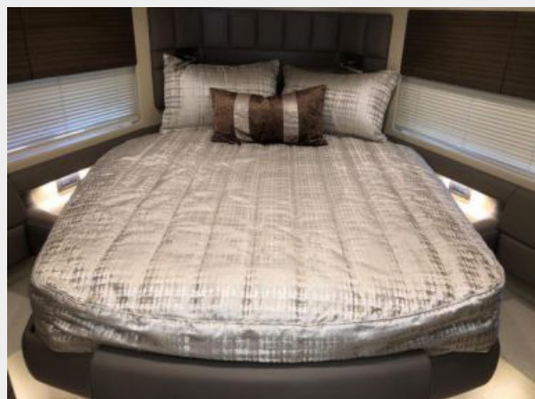
64 Azimut VIP Stateroom 2