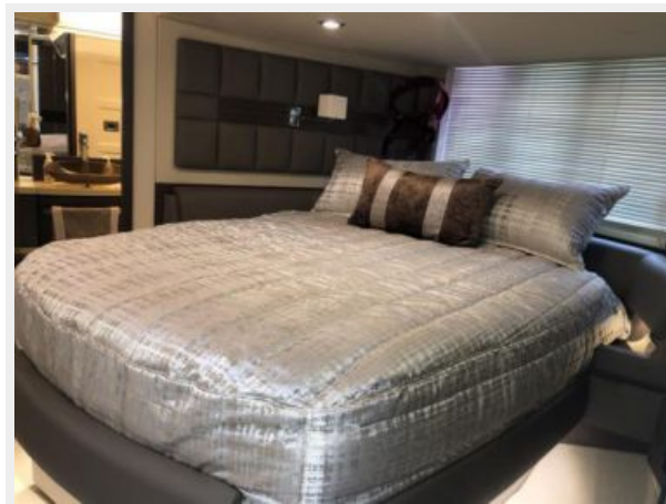
64 Azimut Master 3