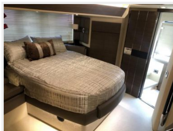
64 Azimut Master