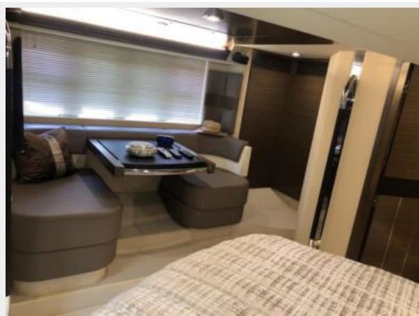
64 Azimut Master 2