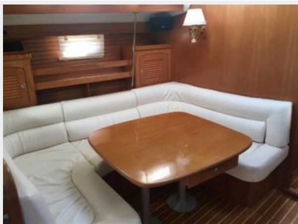
2004 Catalina 470 - Immaculate interior