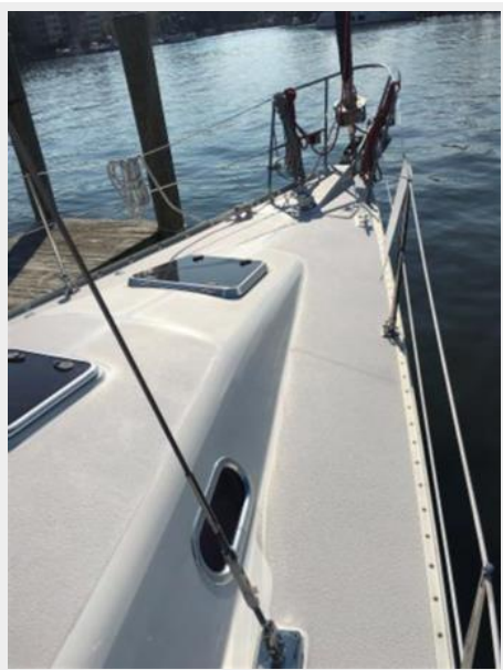
2004 Catalina 470 - clear foredeck