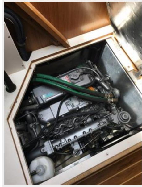
2004 Catalina 470 - Clean engine space