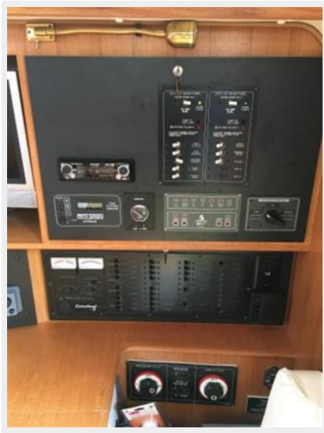
2004 Catalina 470 - Electrical distribution panel/ Nav station