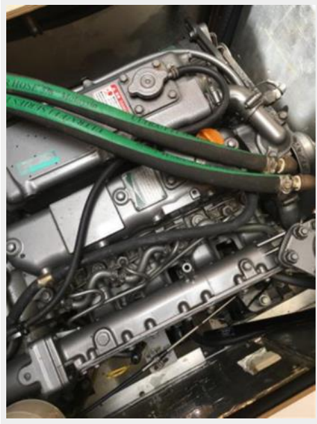
2004 Catalina 470 - Very clean Yanmar engine with 95 hours