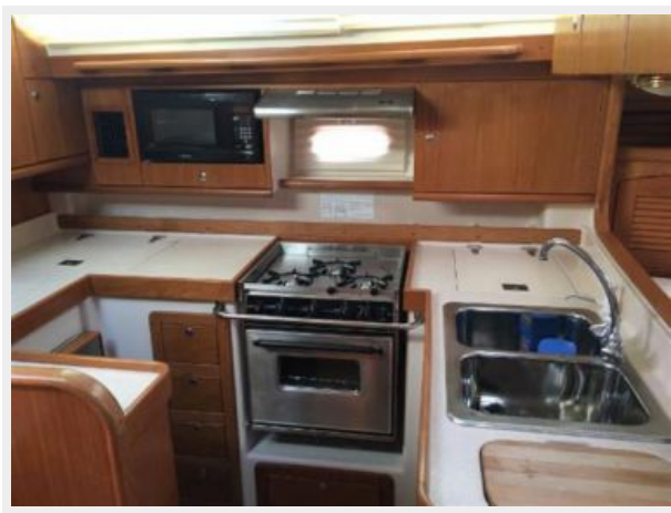
2004 Catalina 470