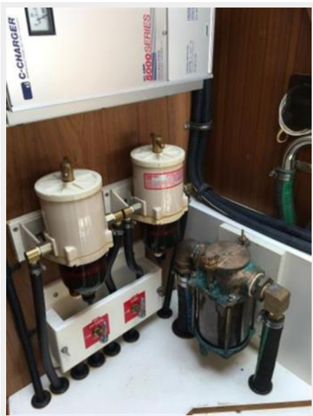
2004 Catalina 470 - Twin racor set up in easy access