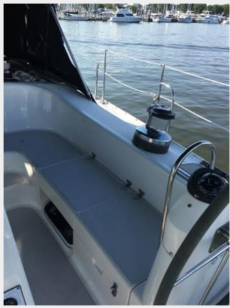
2004 Catalina 470 - Protected and comfortable cockpit