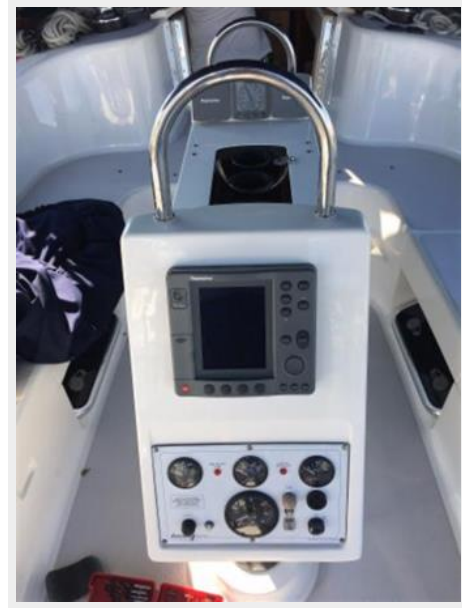
2004 Catalina 470