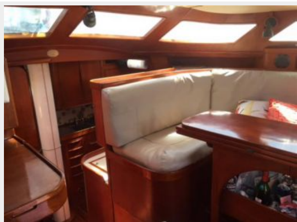
Raised Saloon, Looking Fwd.