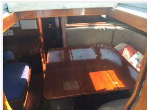
Saloon Table, Open, from Cockpit