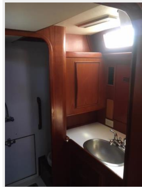
Owner's Head Sink