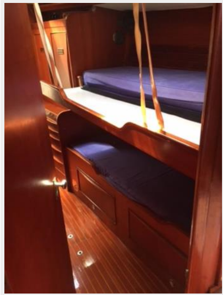
Stbd. Cabin Berth Extension