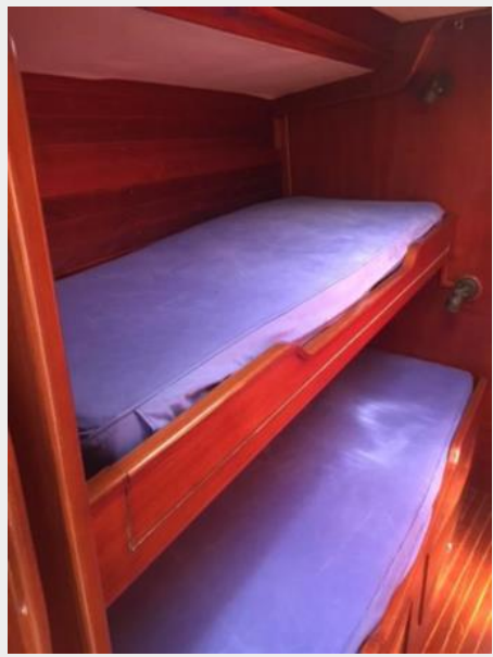
Port Fwd. Cabin