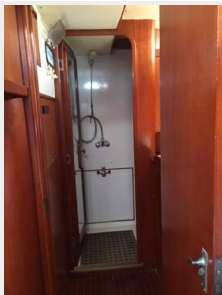
Owner's Head Shower