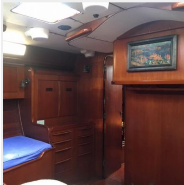
Owner's Cabin, Port Fwd.